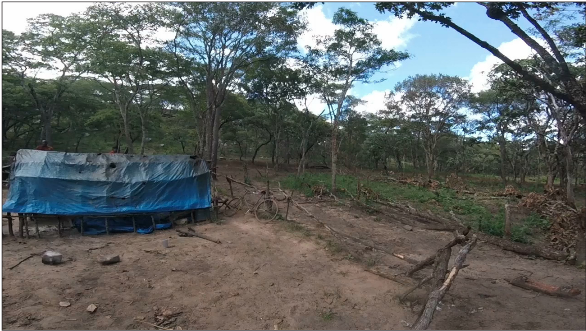
Figure 4. Abandoned corral by Tanzanian herders.

also increase their perceived risk (Hoare 2019). Charred landscapes increase exposure of animals to predation (Figure 1) and so chimpanzees may perceive greater risk given the lack of vegetation to conceal their presence, especially since the cattle are frequently accompanied by people and domestic dogs (see above).