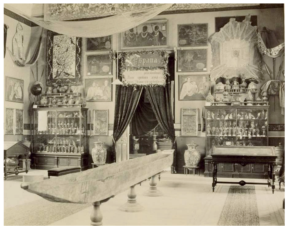
Figure 3.1: Official image of Spain's display at the Exposición Histórico-Americana de Madrid, Madrid (1892)