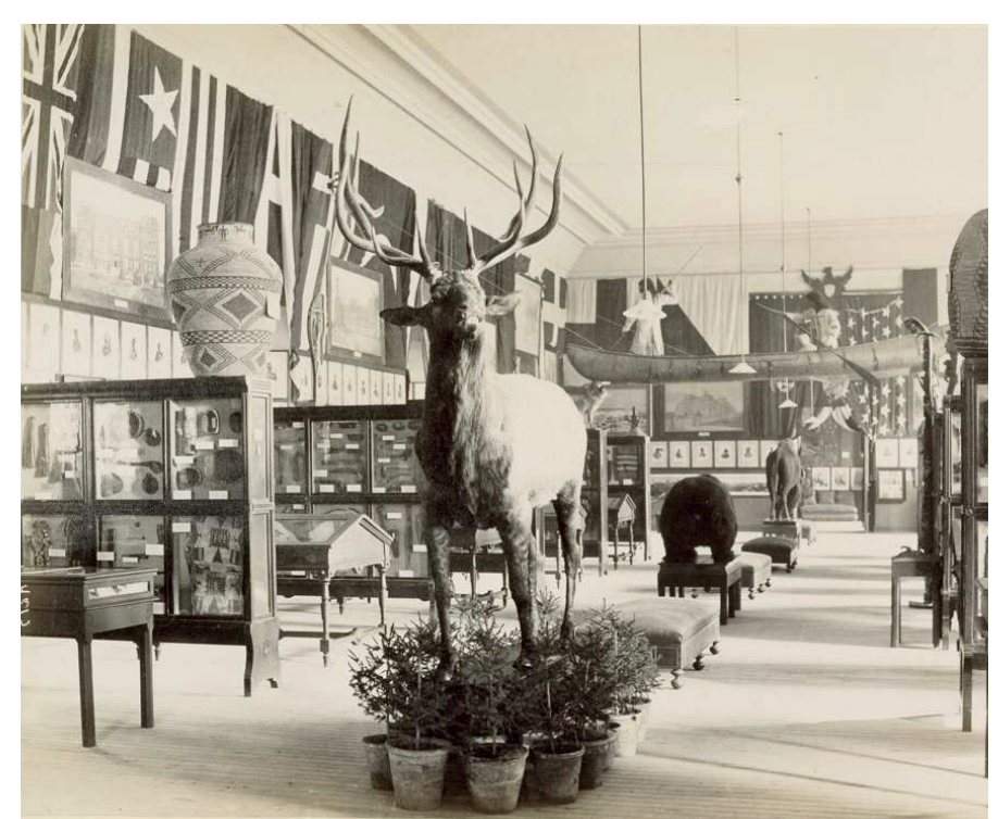
Figure 3.2: Official image of the United States' display at the Exposición Histórico-Americana de Madrid, Madrid (1892)