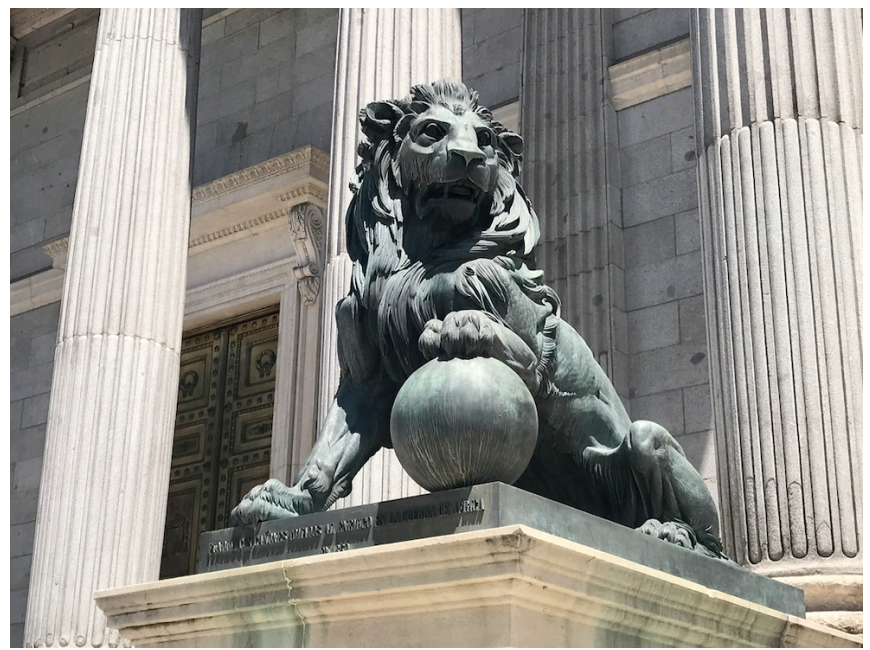
Figure 1.4: Image of lion commissioned from enemy cannons following Spain's War of Africa in 1860

In addition to the bronze lions commissioned to represent victory in the war in Morocco, various other monuments were commissioned during the Isabelline regime to commemorate of significant military events that had a