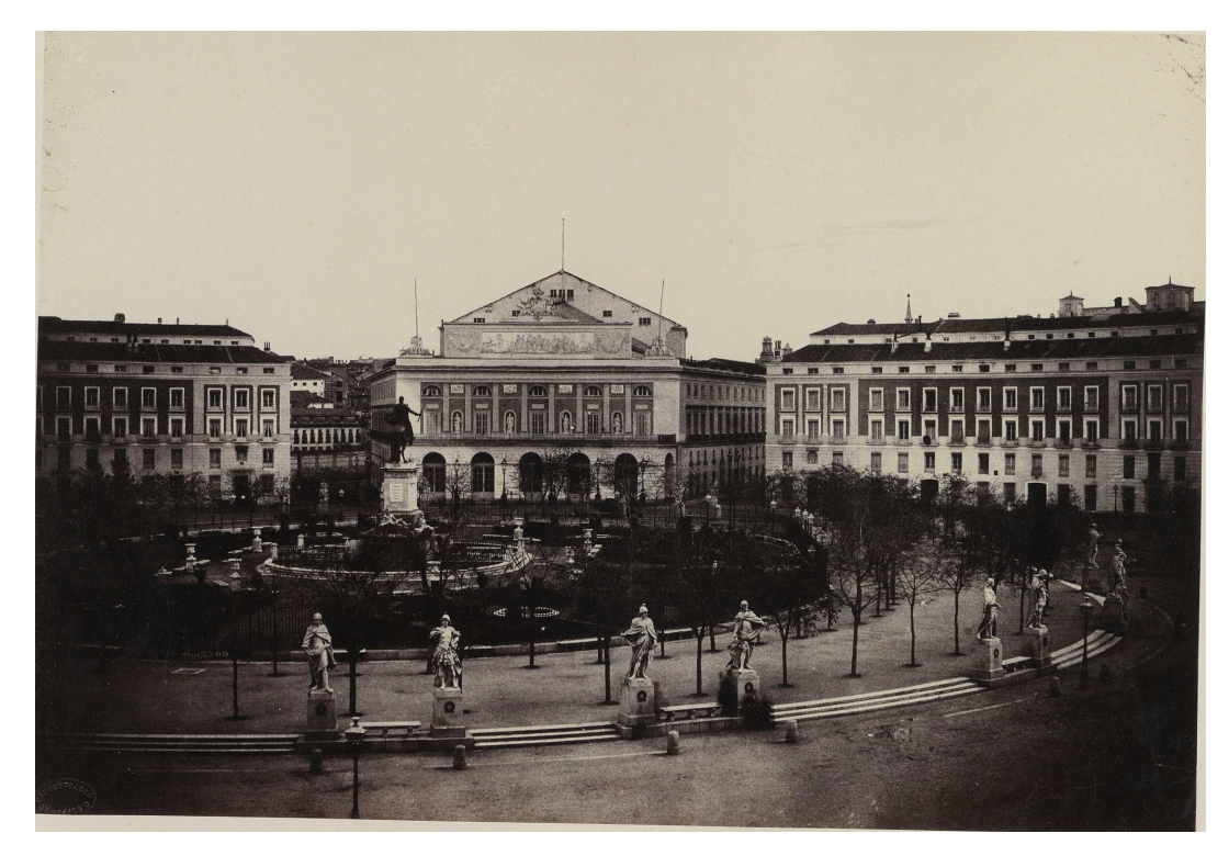
Figure 1.2: Image of Plaza de Oriente con el Teatro Real de Madrid al fondo, Charles Clifford, Madrid (1853) Source: Biblioteca Nacional de España, 17/26/111