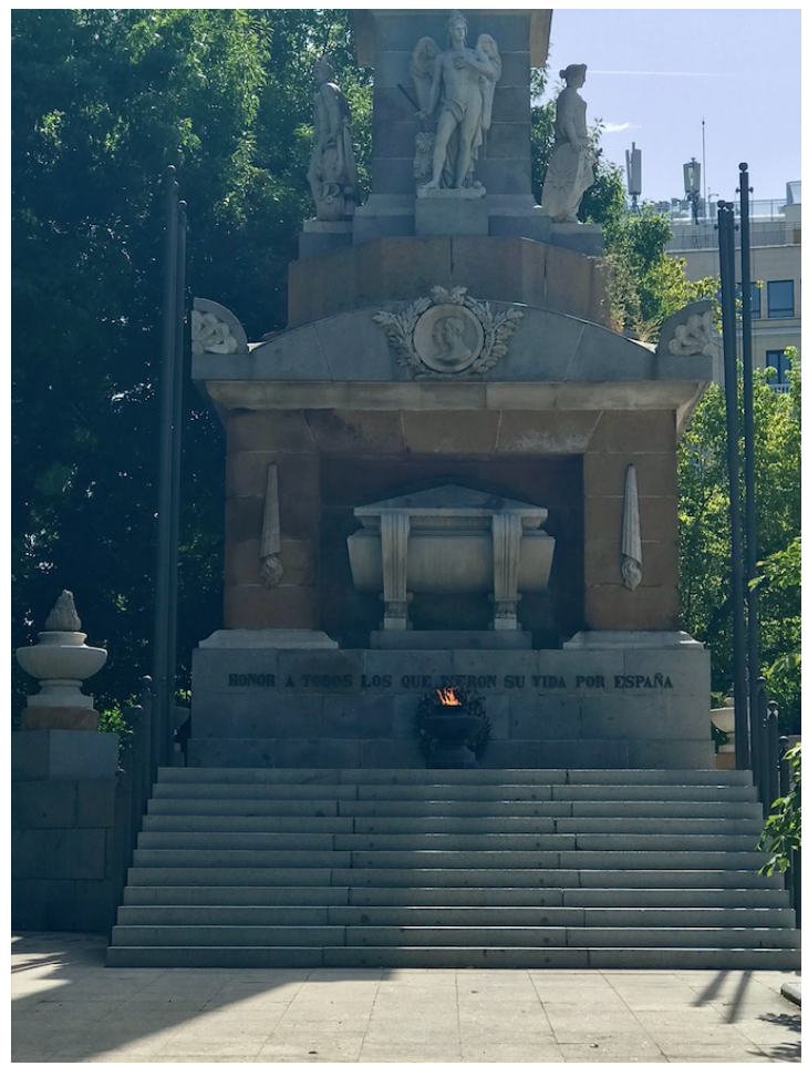
Figure 1.6: Detail image of Monumento a los Héroes del Dos de Mayo / the Monument of the Fallen, Madrid, photograph by author Inscription reads: Honor a todos los que dieron su vida por España