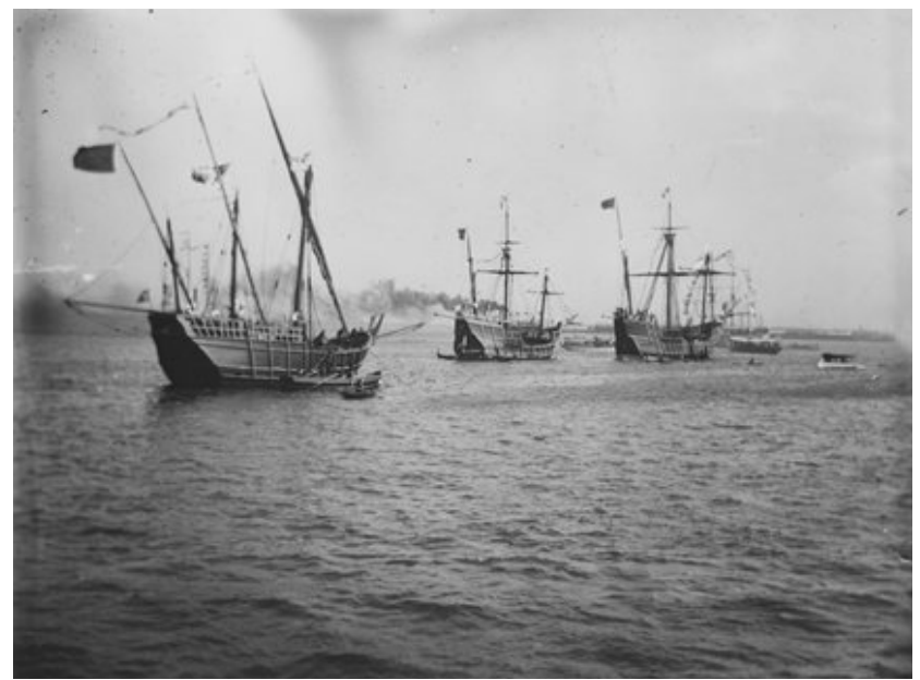
Figure 3.4: Image of the replica caravels, the Niña, Pinta and Santa Maria, arriving for the World's Columbian Exposition in Chicago, Illinois, Franklin S. Catlin, 7 July 1893

The original building plans for the three vessels were thoroughly researched by historians at the Royal Historical Society in conjunction with military officials in the Spanish naval records in order to produce the most historically accurate representations of each ship. <sup>640</sup> Both the United States Congress and Ministerio de Fomento released funds to contribute to the project; It was decided that the historical replicas of the Niña and Pinta would be constructed in the United States and that the Santa Maria , Columbus' flagship, would be constructed in Spain near Cadiz. Upon the completion of the Santa Maria , the historic vessel along with other ships of the Spanish historic naval fleet left La Rabida, Spain and proceeded to follow the exact route mapped out by Columbus on his first journey to the New World four hindered years before. <sup>641</sup> The fleet, led by Capitan Victor Concas, made its first ceremonial stop in Havana where his fleet was joined by the American made reconstructions of