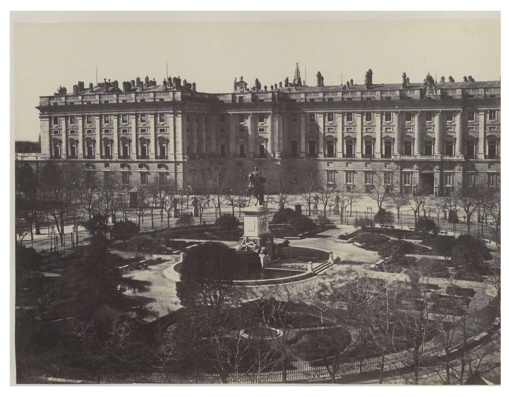
Figure 1.1: Image of Plaza de Oriente y Palacio Real, Charles Clifford, Madrid, (1857)