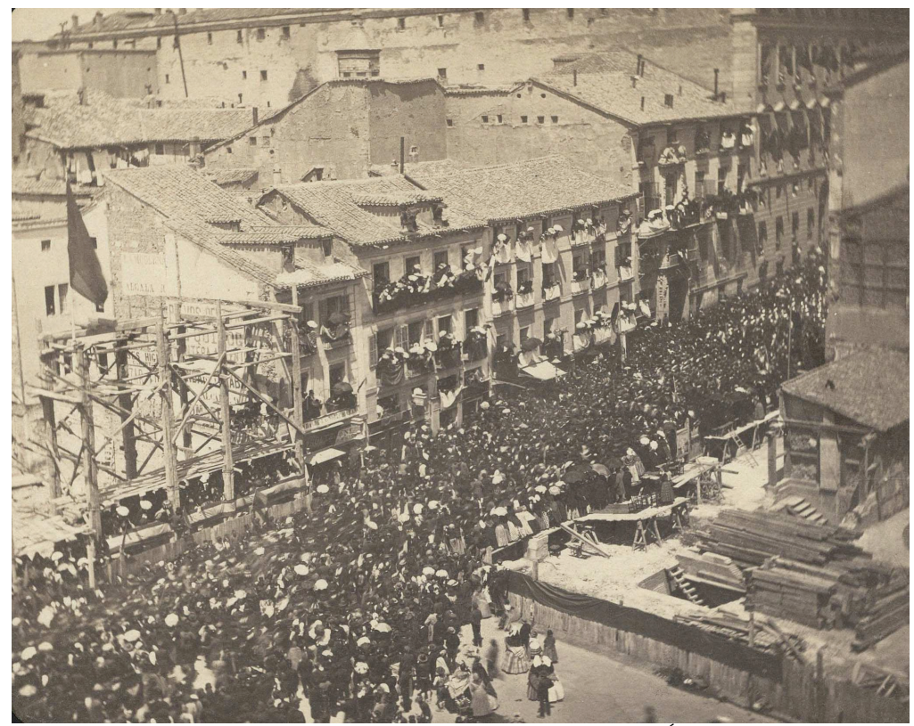
Figure 1.3: Image of O'Donnell junto a las tropas de la Campaña de África pasando por la Puerta del Sol en 1860, Madrid (1860) Source: Biblioteca Nacional de España, 17/32/43