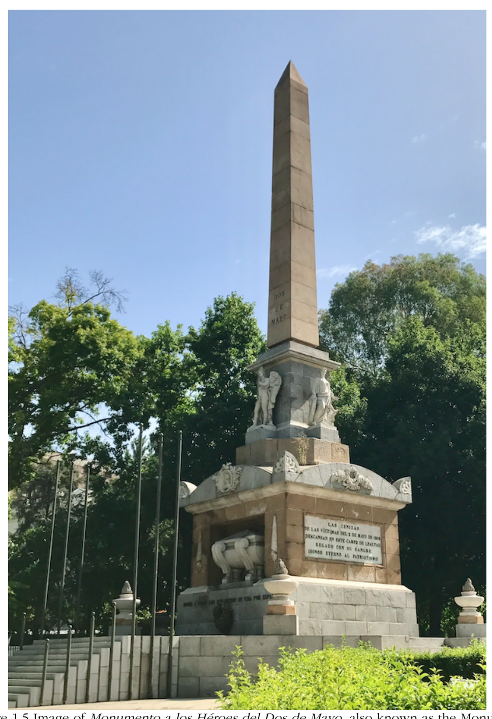
Figure 1.5 Image of Monumento a los Héroes del Dos de Mayo , also known as the Monument of the Fallen, Madrid, photograph by author Inscription reads: Las cenizas de las victimas del 2 de mayo de 1808 descansan en este campo de lealtad. Regado con su sangre. ¡Honor eterno al patriotismo!