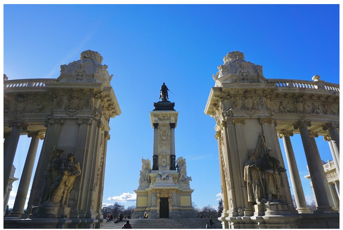
Figure 4.3: Image of Monument to Alfonso XII (back detail), Parque del Buen Retiro, Madrid, photograph by author

In addition to the state subsidized projects focusing on national festivals and public sculpture, the arts were a major focus of the state-sponsored cultural program in post-imperial Spain. After the Spanish American War was over, Spanish government officials scrambled to retrieve their artistic, scientific and culturally significant artifacts from Cuba, Puerto Rico and the Philippines as quickly as possible before the new regimes could be installed. For example, after the Treaty of Paris, which was ratified in 10 December 1898, Spanish officials were still trying to export these items from the Philippines. However, in the Philippines, American border officials who were already in place contested Spanish possession of these items and either refused to let them leave Manila or taxed them heavily. This seizure of Spanish artistic and cultural property infuriated Spanish officials so much so that under the direction of the Queen Regent, the former consulate general of Spain in the Philippines wrote a strongly worded dispatch to the Spanish minister in Washington to relay to the