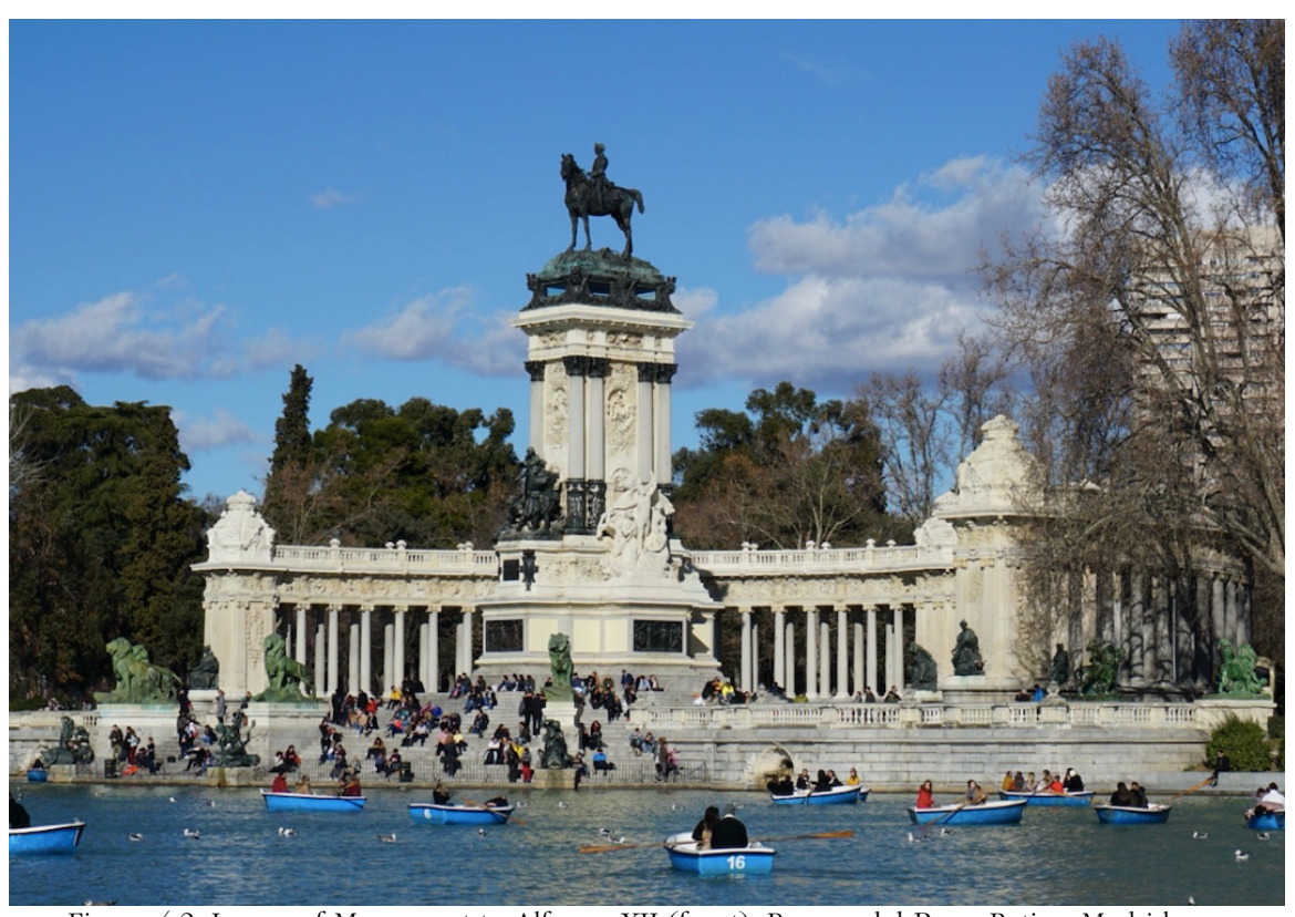
Figure 4.2: Image of Monument to Alfonso XII (front), Parque del Buen Retiro, Madrid

government of the late Restoration era closely mimics the techniques that were used to legitimize the rule of Isabel II in the 1830s during the Carlist War and after her ascent to the throne at a young age. Spanning almost ninety meters wide, the dramatically spectacular monument dedicated to Alfonso XII represents an 'ideological referent' for the Restoration government of the twentieth century; the monument not only publically conveyed the power of the regime, its prosperity and the skill of its artists but the imposing memorial also cemented the late king's place in Spain's public memory for decades, if not centuries, to come. <sup>769</sup>