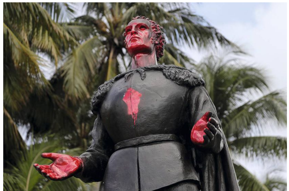
Figure 5.1: Columbus Statue Arrests, June 11, 2020.

Spain's Foreign Minister, Arancha González Laya, had dispatched numerous letters to dignitaries in the United States asking for the protection of these monuments. She highlighted the 'importance [Spain gives] to this shared history with the United States' in the hopes of receiving aid from American authorities.<sup>807</sup> Additionally, González Laya noted that if the American people wanted to protest historical figures of questionable or 'diverse' character, they need not look no further than George Washington or Thomas Jefferson. 808