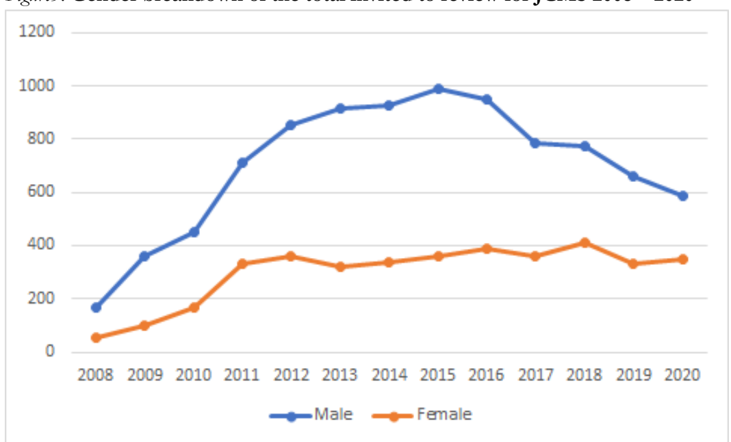
Figure 3. Gender breakdown of the total invited to review for JCMS 2008 – 2020

By calling attention to particular modes of non-participation, this data may perhaps help to illuminate the extent to which structural barriers contribute to keeping women out. For example, one of the most interesting distinction we found here is between the ratios of 'declined' and 'unavailable'. The average ratio of those who declined to review is 4:1 (men: women) whereas the average ratio for unavailable is 2:1 (men: women). Thus, male scholars are four times more likely to simply decline an offer to review, the category of unavailable, which may suggest competing priorities that do not allow for women's participation. It is important to note that this is not an exert science since it is possible that reviewers do not distinguish between the two categories. What is interesting is that since 2017 (the Haastrup-Whitman led editorial term), the gaps in the decline/uninvited rate between men and women has decreased. This is partly due to the increase invitation of more women. Another explanation however may be that the broadening of subject matter has allowed for the greater participation of women.