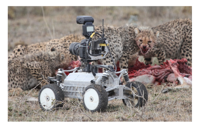
Fig. 1. A cheetah cub being disturbed at a kill by an amateur photographer's use of a remote camera in a National Park in Tanzania.

Negative interactions between humans and wildlife are at the crux of many conservation issues, with human-wildlife conflict recognised as a leading threat to terrestrial large carnivores (Ripple et al., 2014). Careful consideration should be given before showing people in close proximity to, or interacting with, wildlife. For example, in the BBC Dynasties series, during the African wild dog ( Lycaon pictus ) episode (episode 4: Painted Wolves), the 'life behind the lens' feature (in this case called 'Dynasties: on location') showed