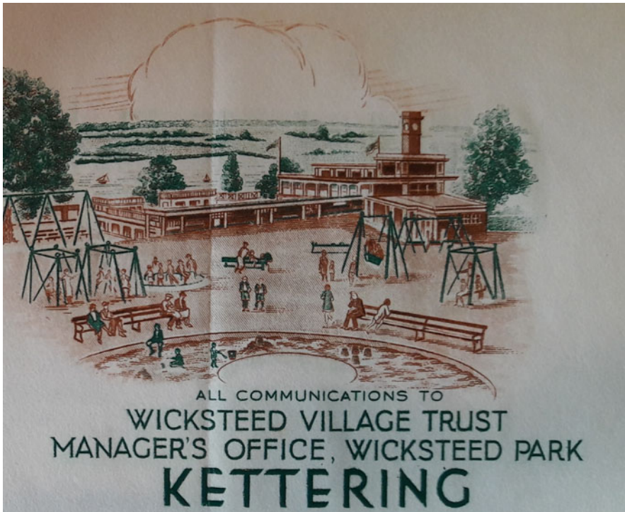
Figure 3. Wicksteed Park letter head, n.d., WPA.

had developed a machine to cut and butter bread at a rate of one slice a second and a water jet system to deliver 5 gallons of tea a minute. 66 Together, these factors created a strong cultural attachment to the park among local people and regional visitors, but it was other processes that contributed to Wicksteed's influence on wider understandings of the playground.