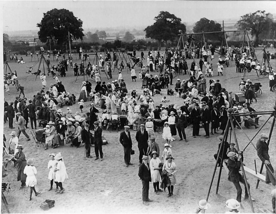
Figure 2. General view of Wicksteed Park playground, c. 1920, WPA.

his products were directly inspired by amusement park rides. After demonstrations at Kensington Olympia and Great Yarmouth, a joy wheel was installed at Blackpool Pleasure Beach around 1913. 63 And while the Blackpool wheel was mechanized and sought to dislodge its riders, Wicksteed's 1926 playground version was considerably smaller, self-propelled and had more places to hold on (see Figure 4). Although different in scale and design, the Wicksteed joy wheel was clearly inspired by the amusement park equivalent.