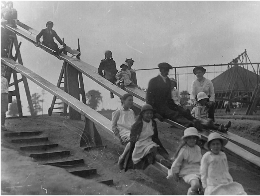
Figure 5. Wooden slides in Wicksteed Park, c. 1920, WPA.

ground and example of what was possible, Wicksteed & Co. supplied playground equipment to parks and playgrounds across the country in increasing numbers. Even after Wicksteed died in 1931, the company continued to promote and sell playground equipment widely. In 1933, Wicksteed & Co. claimed to have supplied over 1,600 playgrounds and by 1937 over 4,000. 70 From its first volume in 1937 until 1959, the front page of the Journal of Park Administration was dominated by a full-page advert for Wicksteed & Co., invariably with an image of a Wicksteed-supplied play space, reinforcing the idea of the equipped playground as the norm among park managers. In addition, the company also sold equipment around the world, supplying playgrounds across six continents and even the remote Atlantic island of St Helena. 71