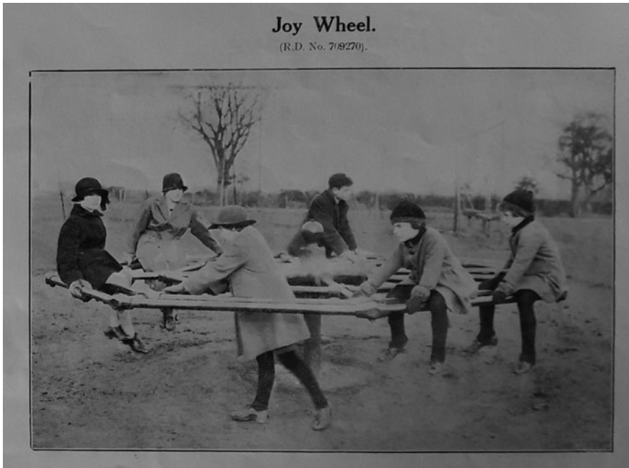
Figure 4. Joy wheel, 1926, WPA.

for playful excitement, where children of all ages could play together. The notion of the playground as a space for exercise had not been broken entirely. Rather, structured forms of gymnastic exercise had been replaced with play things that were seen to promote playfulness in both children and adults alike (see Figure 5).