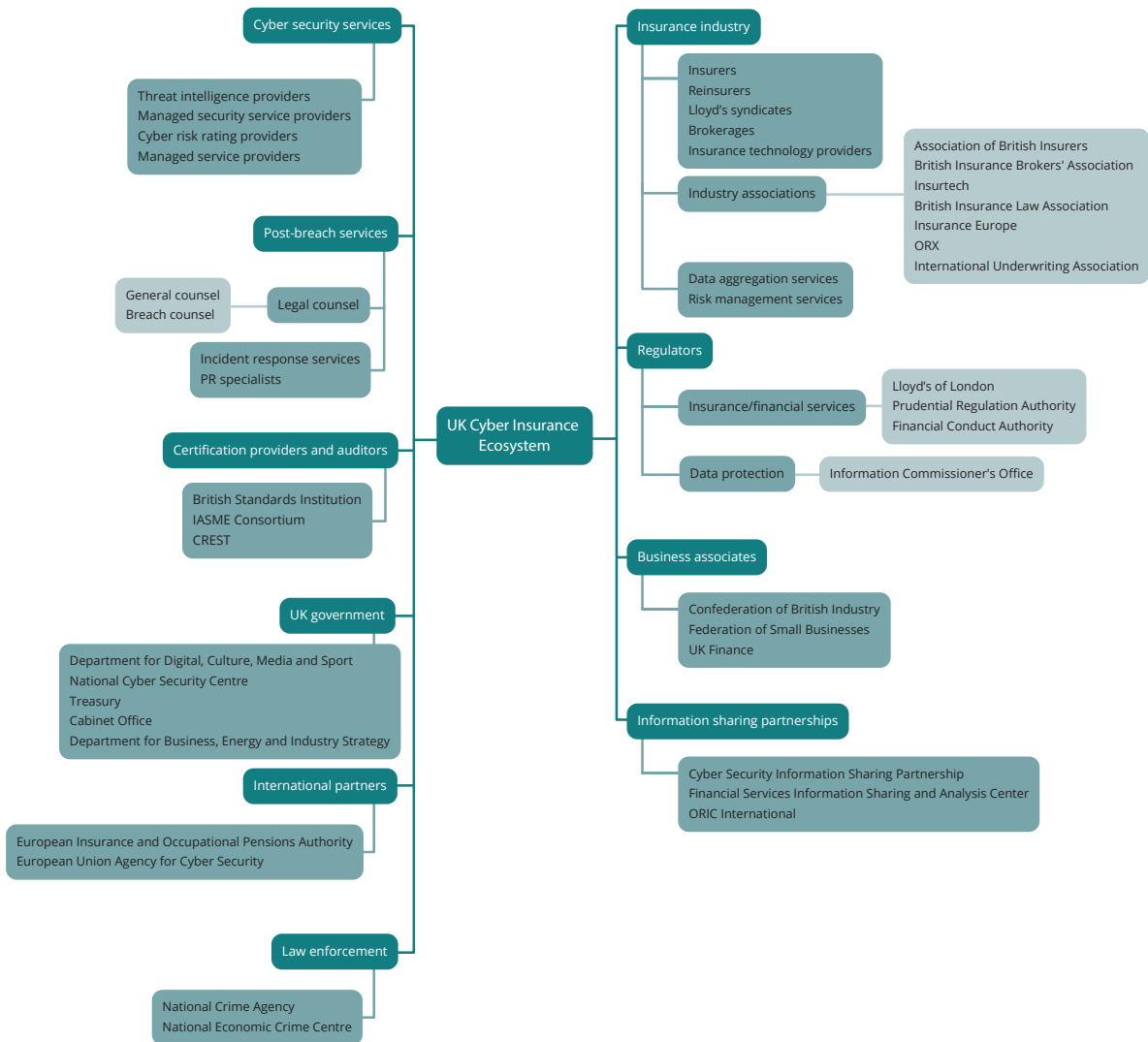
Figure 2: The UK Cyber Insurance Ecosystem