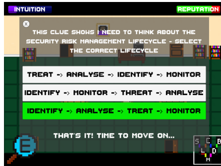
Fig. 3: Correct answer with praise and Intuition points given