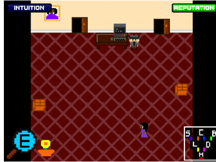
Fig. 2: The game’s 2D interface. The ‘E’ in the bottom left highlights a clue has been found. A mini-map is depicted in the bottom right.

answer to prove to Ginny that she’s up to the task. As Sherry traverses the house, there are also various locked rooms, each room represents a new case that can only be accessed by answering enough questions correctly on the current level.