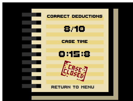
Fig. 5: Case closed as the player has answered sufficient questions correctly on that level to proceed.

If all intuition XPs are gained, the player is shown their score and a notification that they have “closed” the case on that level (Figure 5). This presents an achievement within the game and allows them to progress. If all reputation points are lost, the level is over and the player is shown their score and a notification they have been “fired” by Ginny from the case (Figure 6).