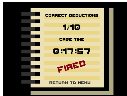
Fig. 6: Player fired due to too many wrong answers on the case (and a full loss of reputation).