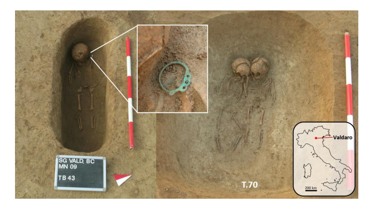
Figure 1. Photographic record of tombs 43 and 70, showing the earning found in tomb 43. The location of the Valdaro site is also reported in the inset.