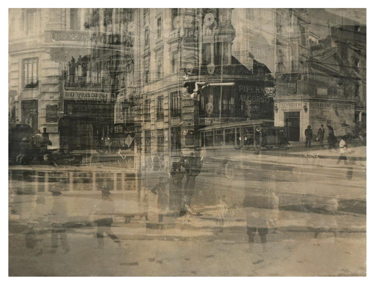
Figure 2: 'Moderner Verkehr im alten Rom' by Mario Bellusi [1930] (Modern Traffic in Ancient Rome) silver print 154 x 202 mm. Mart, Archivio del '900, Fondo Somenzi. Catalogue number: Som.VI.11.18