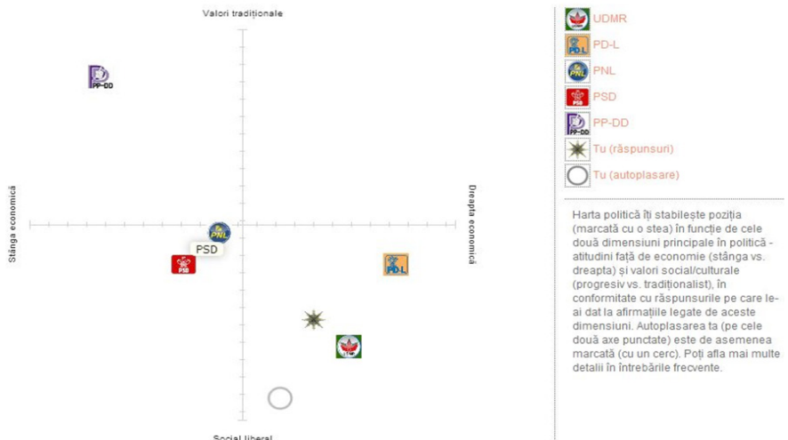
Figure 1. Positions of political parties according to expert surveys used in the VAA Votulmeu at the 2012 parliamentary elections. These positions are matched with the users preferences.

In addition to the preferences on policies users were asked questions on party identification, voting behavior and left and right. "Votul Meu" contained 18484 respondents. Not all of them completed all the questions in the survey or had valid answers. After applying various filtering procedure 16107 respondents' answers were kept.