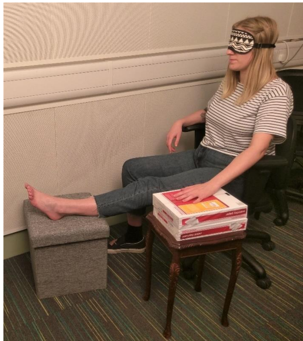
Figure 1. Experimental set-up. Participants sat in a chair with their left foot resting on a foot rest, and their left hand resting on a table. This posture gave the experimenter easy access to both the fingers and toes. Vision was prevented using a blindfold.

The experiment consisted of four blocks, two in which the fingers were stimulated and two in which the toes were stimulated. ABBA counterbalancing was used to vary order of presentation, with the first condition counterbalanced across participants. Each block contained 100 trials, 20 for each of the 5 digits, resulting in 400 total trials completed by the participant. The order of digit stimulation was pseudo-randomised within each block of trials, so that there was an approximately equal number of each type of preceding trial.