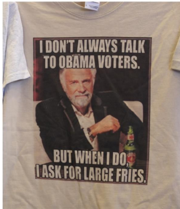
Fig 1. Anti-Obama sentiment at PrepperFest: Health insurance campaigners instructing attendees to 'Ask Me About NO'Bama Care', books critiquing Obama's policy agenda, and stalls selling T-Shirts printed with memes mocking Obama's supporters