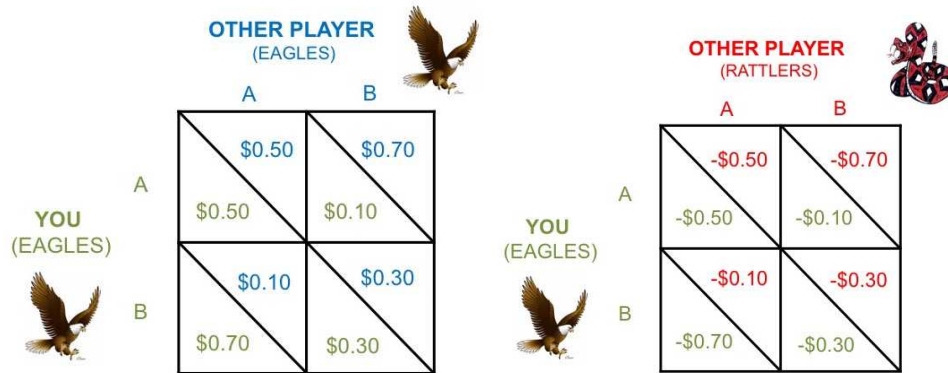
Figure 1. Example Matrices given to participants (left: gains frame with in-group partner; right: losses frame with out-group partner)