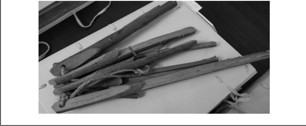
The surviving “wooden rods”