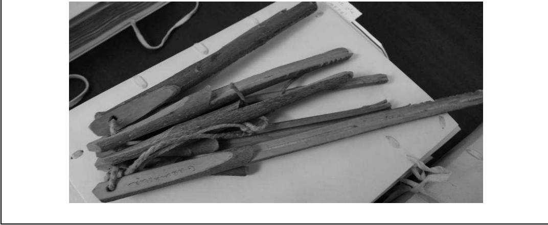
The surviving “wooden rods”