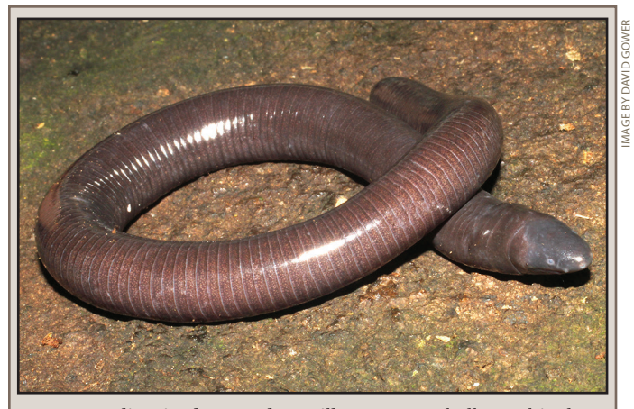
Fig. 4. Grandisonia alternans from Silhouette, Seychelles Archipelago.

DNA extractions and quantitative real time Taqman® polymerase chain reaction (qPCR) assays were performed at the Institute of Zoology (London, UK), using methods adapted from Boyle et al. (2004). DNA was extracted from swabs using bead beating with 0.5 mm silica beads and 60 µl PrepMan Ultra (Hyatt et al. 2007). The qPCR amplifications were performed in 25 µl