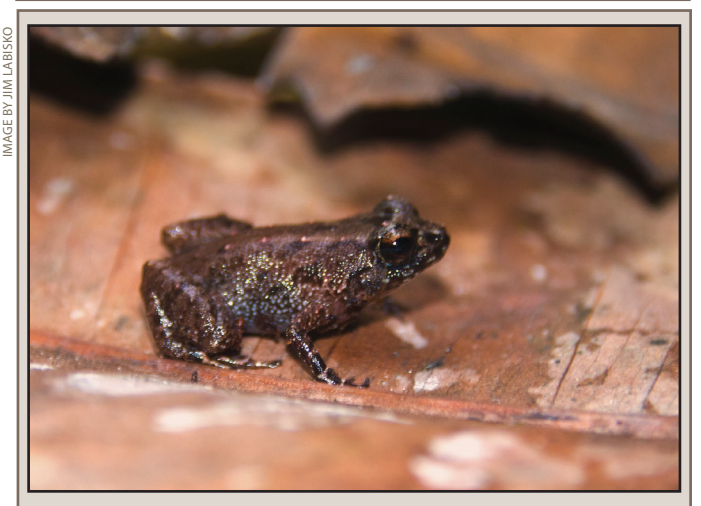
Fig. 3. Sooglossus sechellensis from Mahé, Seychelles Archipelago.

bag, removing the need for direct handling and minimizing risk of cross-contamination. Larger anurans, and sooglossid frogs processed when field assistance was available, were sampled using the standard technique (Smith 2011). Caecilians were swabbed dorsally, laterally, and ventrally along the length of the body, and also around the vent and head. Gloves were changed between each individual except where two or more specimens had been housed in the same plastic bag. All amphibians not retained as vouchers as part of broader research aims were released at their place of capture. Swabs were kept in the dark and transferred to cool storage, mostly refrigerated within 12 h and frozen within one week of completed fieldwork.