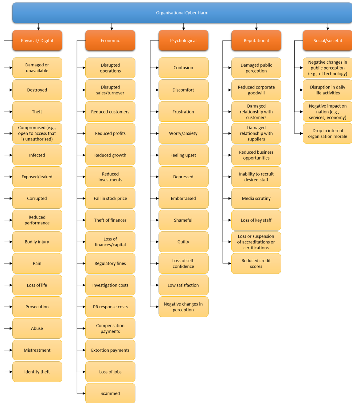
Fig. 1. Taxonomy of organisational cyber-harms