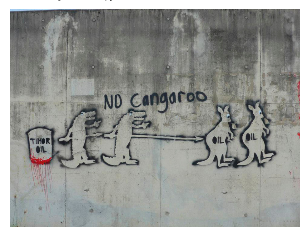
Figure 2 Political Graffiti in Dili.

Initially, Woodside Petroleum had planned to process the resources from the Greater Sunrise oilfields via a floating platform. However, political leaders in Timor-Leste insisted on a pipeline that would bring oil and gas onshore for processing. These plans are understood within the historical context of the resistance struggle, as illustrated by the suggestion made by a member of Timor-Leste's oil industry in an interview that 'what we fought for is to own and manage our own oil'. Such claims effectively frame the struggle for oil as part of a longer struggle for full political sovereignty. The repeated humiliations by the Australian government only increased this desire, as the onshore petroleum infrastructure promises to produce visible signs of sovereignty (Bovensiepen in press).