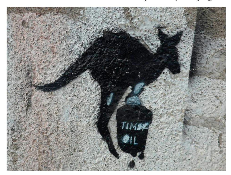
Figure 1 Political Graffiti in Dili.

In February 2016 another series of protests against Australia's 'occupation' of the Timor Sea took place in Dili, part of a broader campaign to settle Timor-Leste's southern boundary and to force Australia back to the negotiating table. Protests were not limited to the streets of Dili, but were also waged on social media. According to political leaders behind the Tasi Mane project, the idea for an onshore petroleum industry has roots in the resistance against Indonesia and is likewise envisioned as part of a general national strategy to secure full sovereignty over the country's borders and over Greater Sunrise oil and gas resources (see also Bovensiepen, in press).