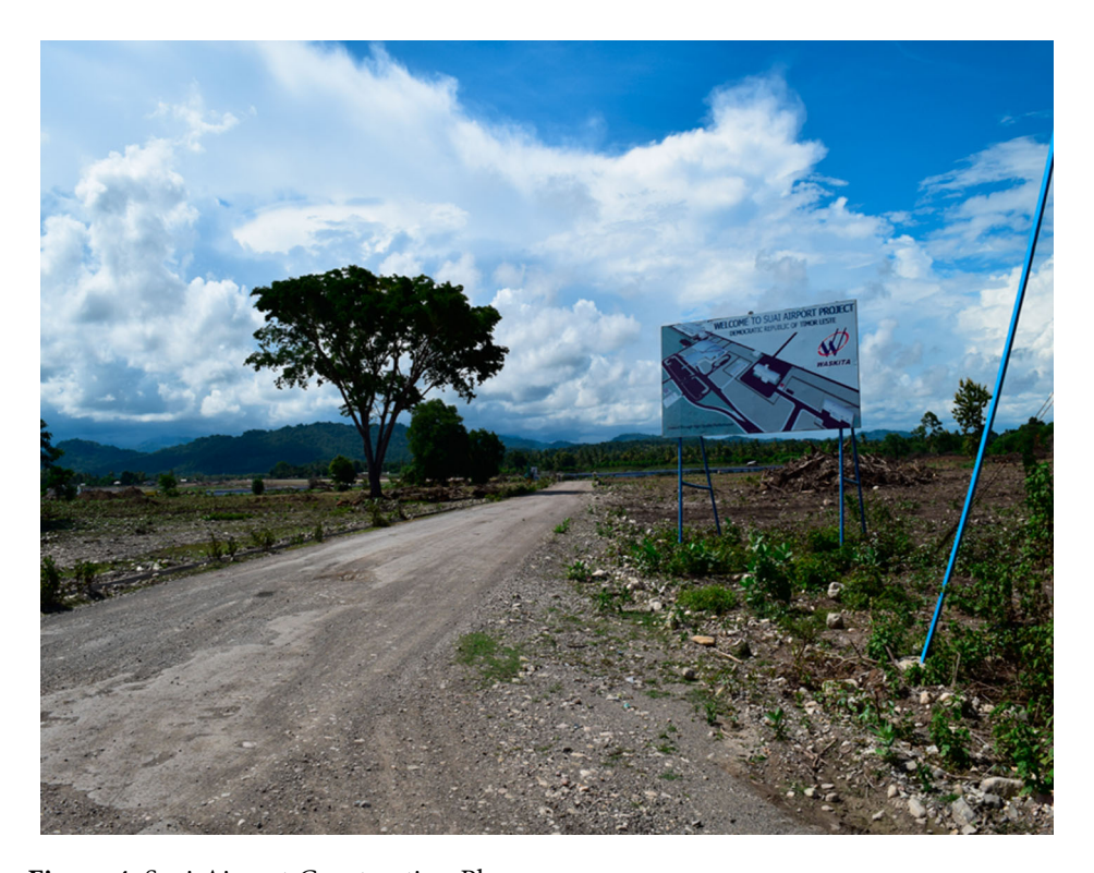
Figure 4 Suai Airport Construction Plans.

The imagery produced of the planned project sites (see Figure 4)—alongside CNRT's political imagery and the explosion of street advertisements of foreign and new domestic products following Dili's recent building boom—give visual shape to this remaking by casting the nation as a 'market' (see also Foster 1999, 274) about