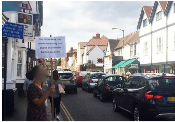
Fig. 1. Level crossing context. The white placard depicts the financial intervention. The blue placard depicts the permanent local authority sign. The permanent local authority sign reads: “please switch off your engine when barriers are down to help improve air quality”. (For interpretation of the references to colour in this figure legend, the reader is referred to the web version of this article.)

Financial, Health, Kin, Control) across barrier drop and direction of approach to the barrier. Barrier drops lasted on average 2.63 min ( SD = 0.79 min), barriers dropped approximately four times per hour during the day, and a mean of 30 cars were sampled per barrier drop. Across days of testing, we randomly varied the time that data collection took place in order to reduce the chance that the same driver would be sampled more than once (e.g., while commuting to work), and so that intervention conditions would not be confounded with the time of testing. We also coded the weather condition (rainy or clear) on each trial.