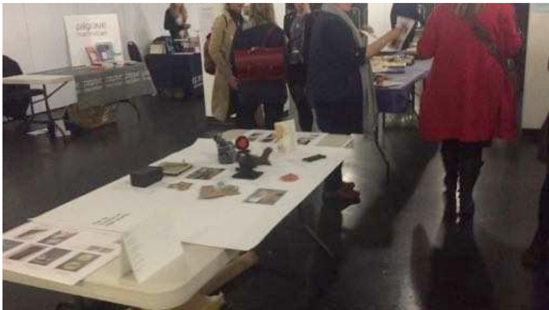
Figure 12 SLSA event models in main meeting space, Newcastle.