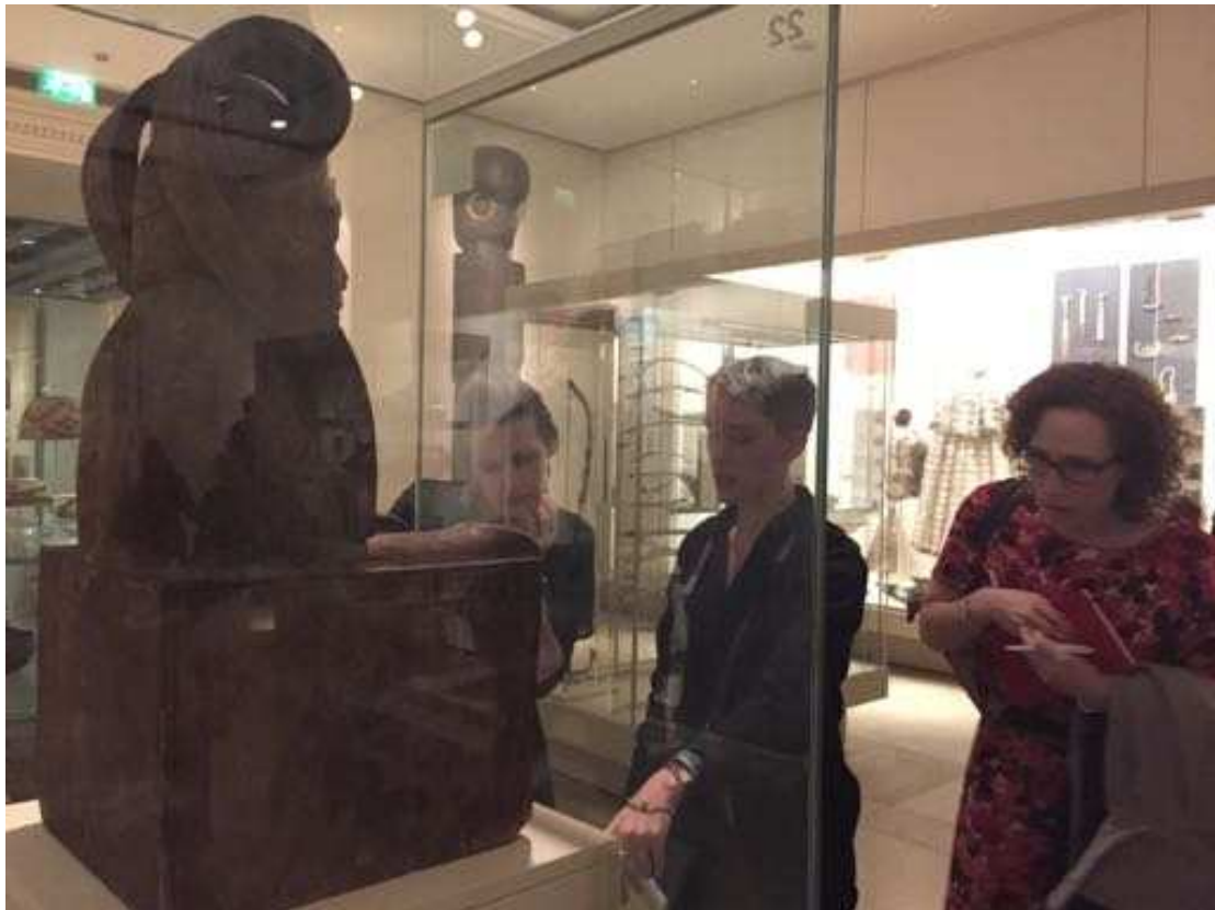
Figure 2 Found model-making.