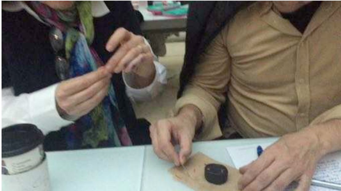
Figure 7 Collaborative making, Great Court, British Museum. Credit Amanda Perry-Kessaris