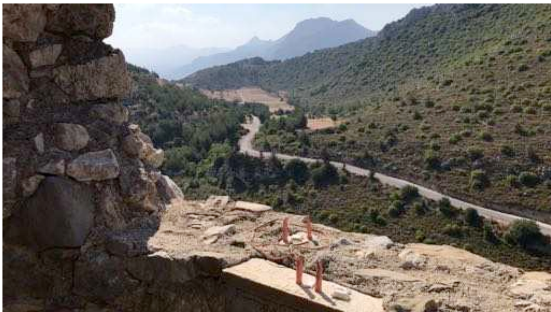
Figure 21 Staging ingot traces at St Hilarion, Cyprus.