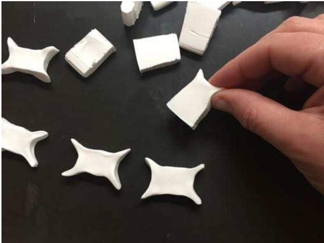
Figure 18 Making the ox-hide ingot traces.