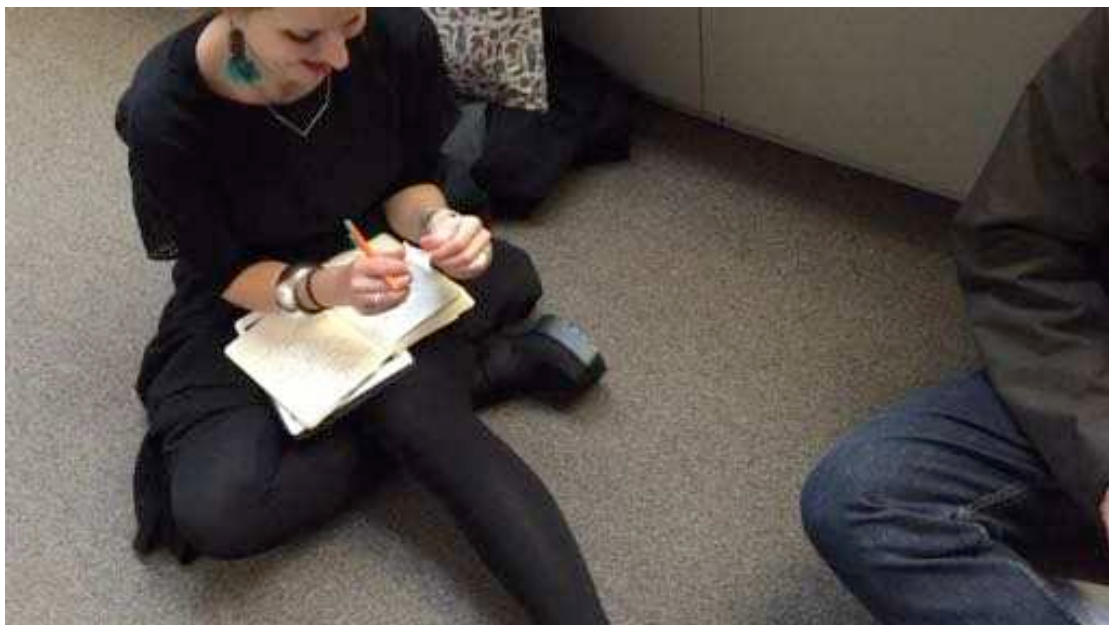
Figure 19 Distributing ingot traces, British Museum.