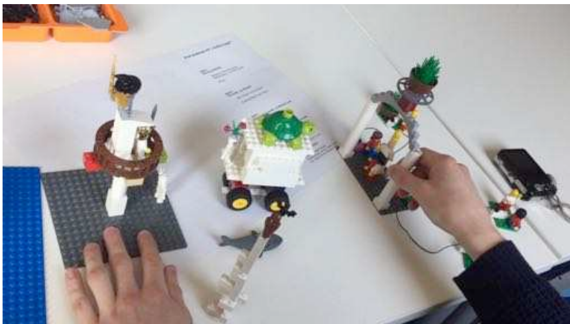
Figure 1 Modular model-making.

By ‘bespoke model-making’ (Figure 3) I mean the creation of entirely new things, out of whatever material seems appropriate given the research purpose and any practical constraints, to represent some abstract or concrete aspect of sociolegal research project. My experimentation suggests that ‘bespoke’ models tend to serve a more speculative function and to be oriented towards more creative enquiries into ‘What if?’ In this case the ‘making’ is at its most physical, shaping the model from scratch.