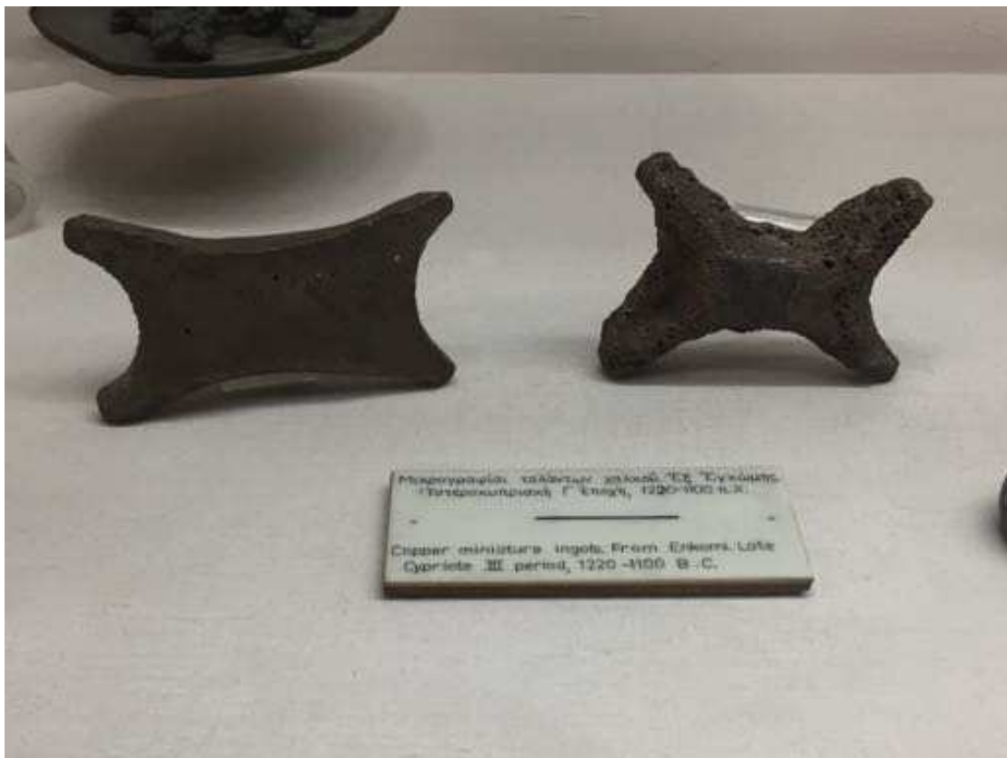
Figure 17 Miniature ingots, Cyprus Museum, Nicosia.