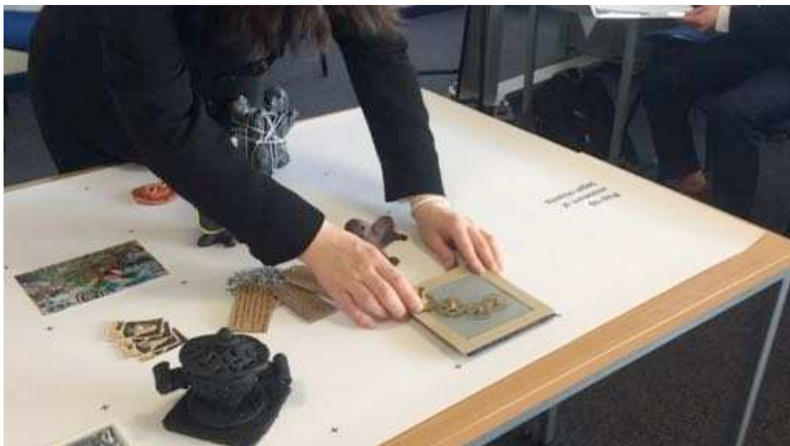
Figure 8 Presenting with a model, SLSA event, Newcastle.