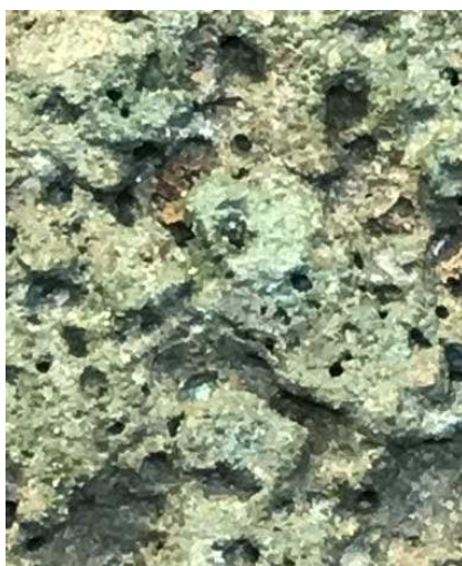
Figure 15 [a,b,c to be displayed next to each other] Getting to know the ingot.