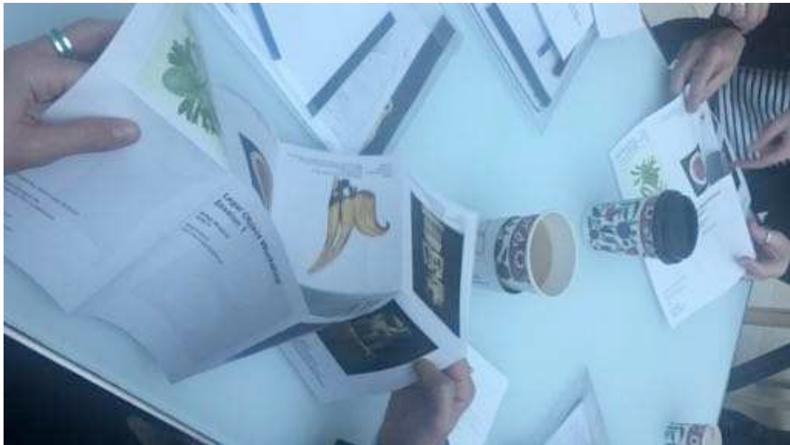
Figure 9 Folding guides, Great Court, British Museum.