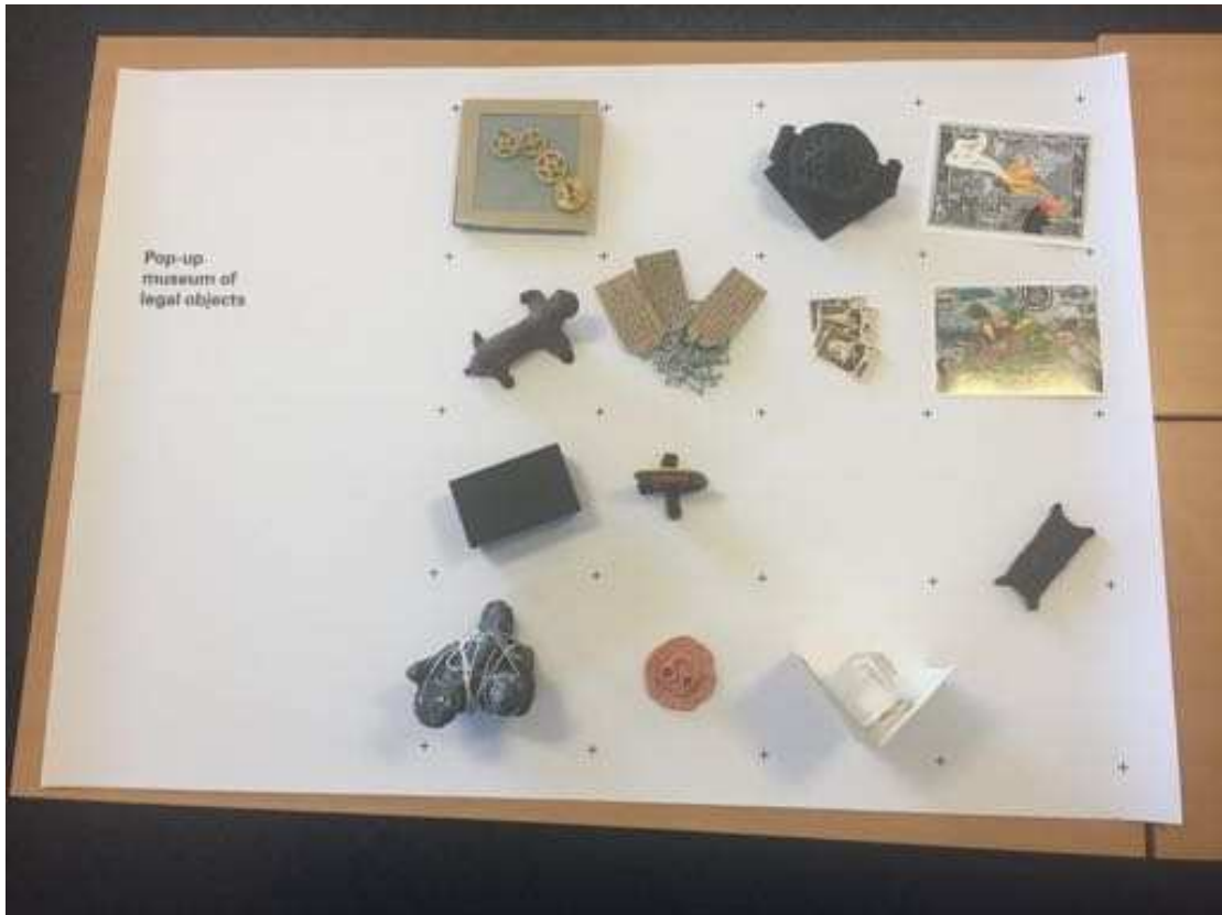
Figure 11 SLSA event models in the conference room, Newcastle.