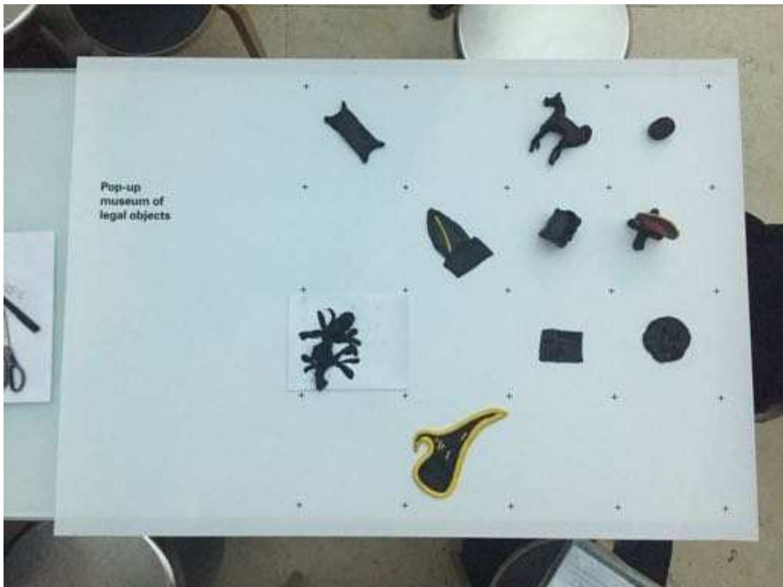
Figure 10 Display, Great Court, British Museum.