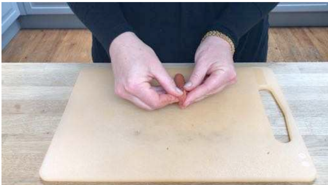
Figure 3 Bespoke model-making.