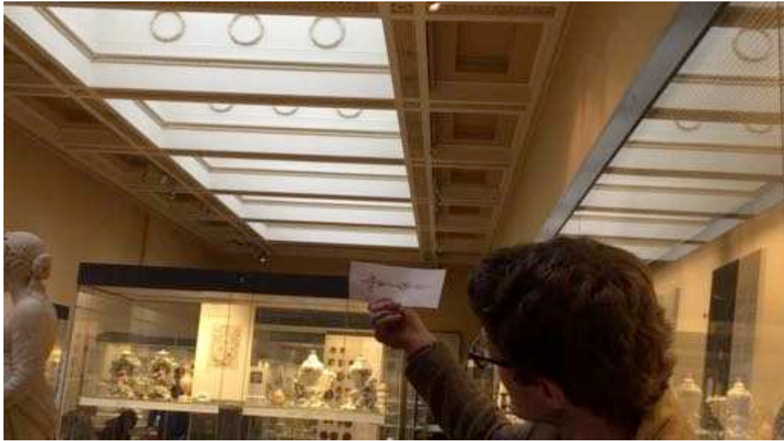
Figure 5 Introducing a trace, British Museum. Credit Amanda Perry-Kessaris