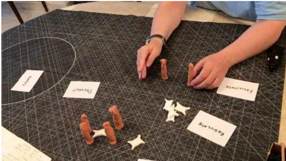
Figure 20 Collaboratively deploying ingot trace in an interview, Nicosia.