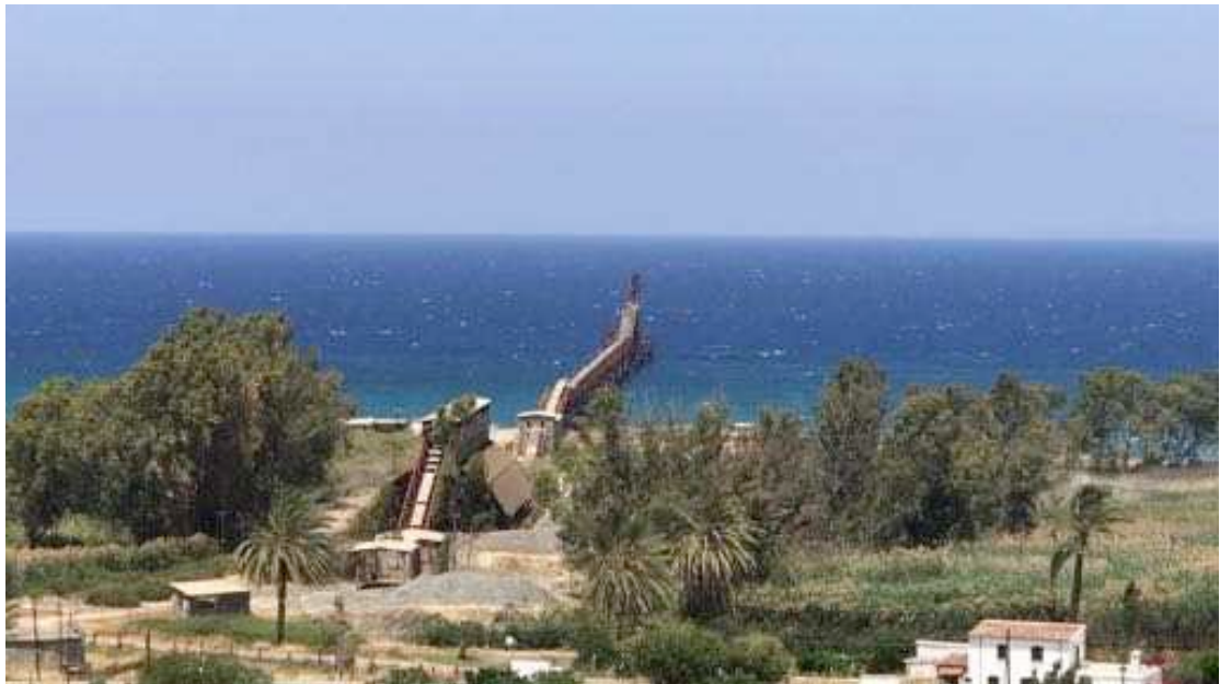
Figure 16 Disused copper transport system, Soli, Cyprus.