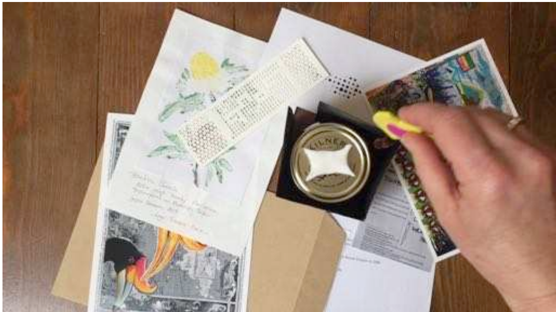
Figure 6 Traces collected at home.