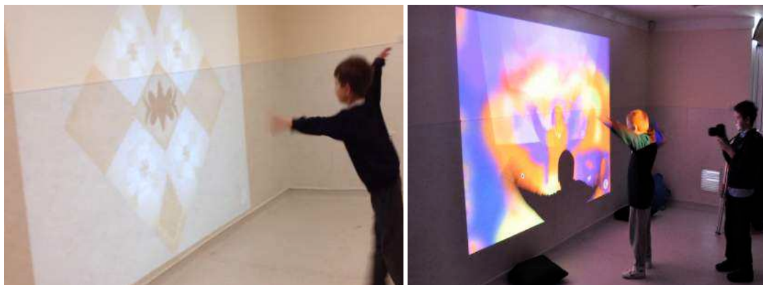
Figure 2. Somantics - Video mirroring ©Wendy Keay-Bright

We then designed five more applications using video mirroring, introducing ghosting, scanning, kaleidoscopic and painterly effects, that could be animated by the body in motion. The visibility of the mirrored body was deliberately kept at a low, almost transparent resolution; instead the focus was on high contrast effects that could amplify the results of interaction (figure 2). Some students appeared to enjoy seeing their bodies mirrored in motion, for others the video had the opposite effect, and they showed no interest, preferring the directness of the graphical responses.