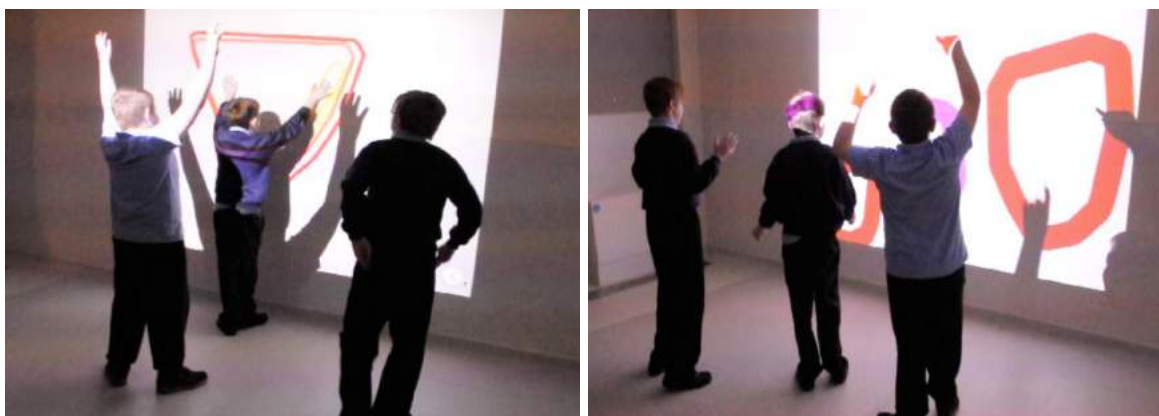
Figure 1. Somantics - Graphical effects ©Wendy Keay-Bright

The drawings and the body movements inspired us to create a series of storyboards that depicted the traces and flow of movement in relation to space. As these required imagining a scenario which was not yet in existence we asked art teachers for feedback, which informed the development of prototypes that used blob tracking and optical flow to capture and replay graphical representations of movement as lines, shapes or colour (figure 1).