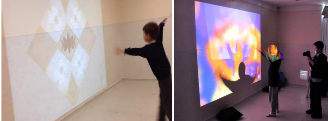
Figure 2. Somantics - Video mirroring ©Wendy Keay-Bright

We then designed five more applications using video mirroring, introducing ghosting, scanning, kaleidoscopic and painterly effects, that could be animated by the body in motion. The visibility of the mirrored body was deliberately kept at a low, almost transparent resolution; instead the focus was on high contrast effects that could amplify the results of interaction (figure 2). Some students appeared to enjoy seeing their bodies mirrored in motion, for others the video had the opposite effect, and they showed no interest, preferring the directness of the graphical responses.