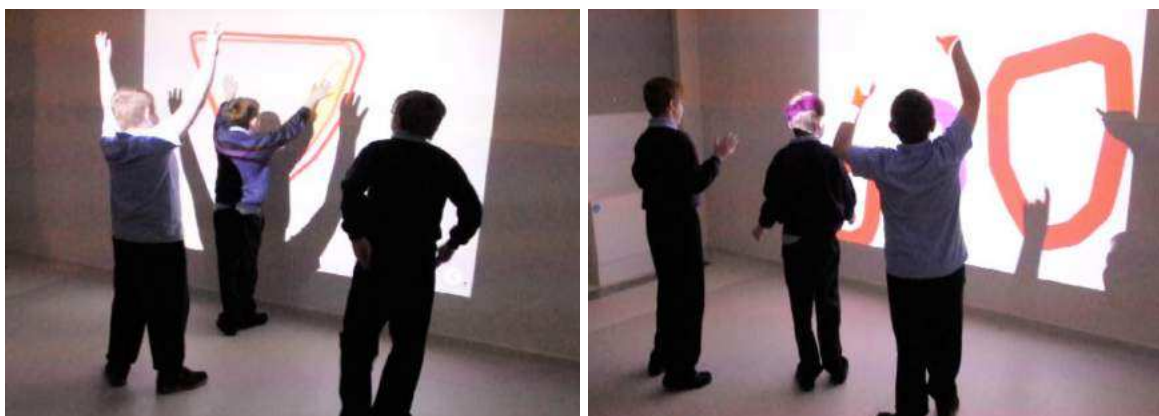
Figure 1. Somantics - Graphical effects ©Wendy Keay-Bright

The drawings and the body movements inspired us to create a series of storyboards that depicted the traces and flow of movement in relation to space. As these required imagining a scenario which was not yet in existence we asked art teachers for feedback, which informed the development of prototypes that used blob tracking and optical flow to capture and replay graphical representations of movement as lines, shapes or colour (figure 1).