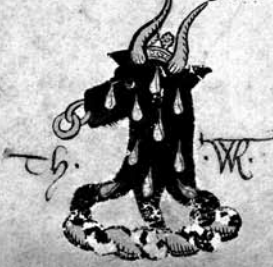
Table of the late folij 2. by m.