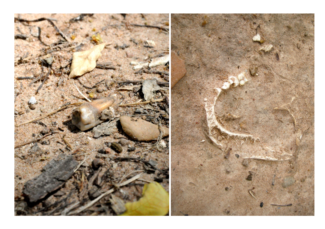
Figure eleven: human remains emerging at Choeung Ek

Like Om Ta, Srey Srey collects remains and frees bits of clothing from the soil as she cleans. Not all the remains are collected though; some are moved and displayed in different areas to 'improve' the tourist experience. As well as remains being moved around, Srey Srey confided, others were left in the paths that people walked on, to improve the attraction of the site to international visitors; one of the guys said: "If we clear all the bones from the ground, what we going to see? We will have nothing to see." 'Some want to show them as evidence for children,' she explained, 'but some want to attract more visitors to see the Cambodian history and improve Cambodian economics.' At first, Srey Srey told me, she was shocked by this attitude, but from watching the tourists interact with the remains she soon recognised their impact: 'They come here to