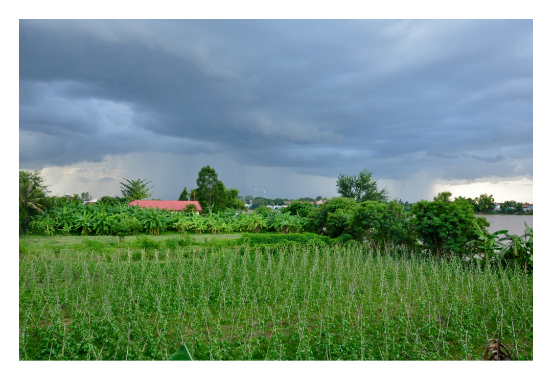
Figure five: farm at Koh Sop. After the regime bodies covered the land

the grounds of the former prison. One or two tend cows for people across the river: the grass is good on the island and ideal for raising calves. A few men work construction, travelling to the nearby towns and cities, and some of the daughters work in the garment factories, coming home at the weekends. Many of the families rely on aid, without which they could not survive. Land insecurity is high at this end of the island: the local Neak Thom [important person - literally translating at big person] is slowly taking the land on the island, metre by metre, through appropriation and debt-collection housing swaps.