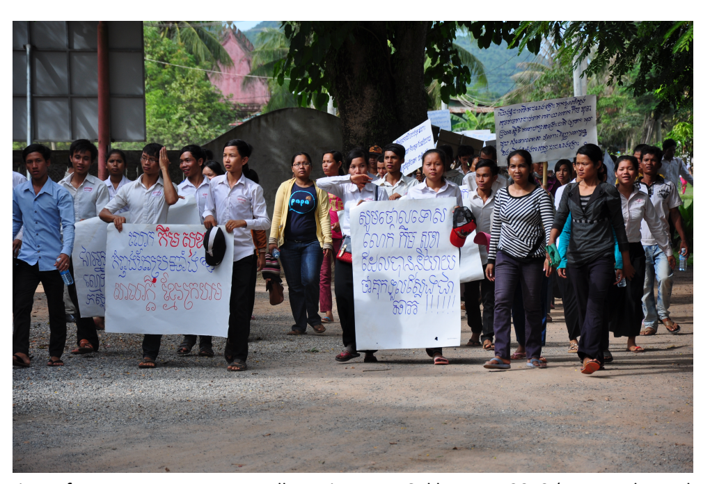
Figure fourteen: protestors at rally against Kem Sokha, June 2013

At the rally, over seventy trucks - official government vehicles - each jammed full of people, drove through the district, blasting denunciations of Kem Sokha from loudspeakers. Arriving at Wat Kampong Tralach, people unloaded and marched to sit in front of the Khmer Rouge cheddei . Many of the teenagers, and some of the adults, carried placards bearing reactionary slogans (figure fourteen): 'We will remember for the rest of our lives the Pol Pot soldiers' brutal acts on our village,' 'Kem Sokha is fighting against the Khmer Rouge Trial,' and 'Kem Sokha is more cowardly than Duch<sup>216</sup>'. The placards had identical lettering, and the same statements repeated over and over again. As my partner later wrote: 'it had the appearance and feel of a regimented spectacle' (Hull 2013).