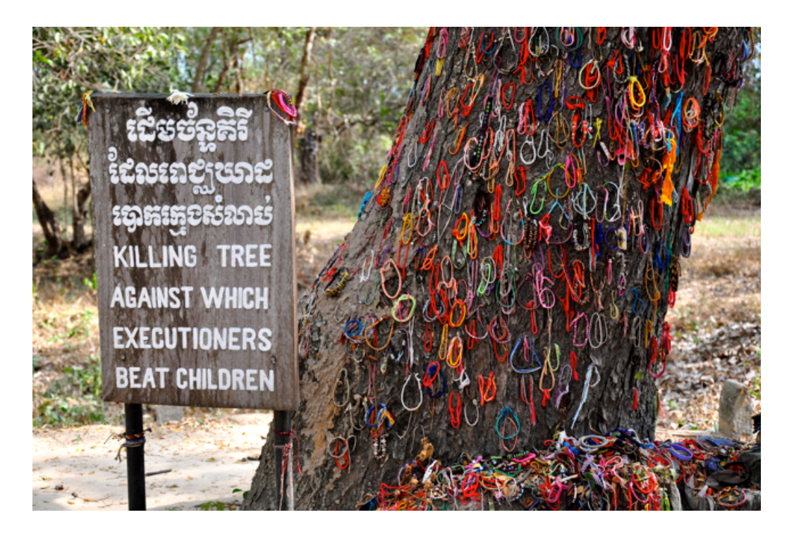
Figure ten: Choeung Ek killing tree

particular. The limited signage tells of terrible things: the bodies of one grave had no heads; another contained only women and children. Rows of pits cover the land, separated only by a small winding path that the tourists walk down. In the path under their feet, remains are emerging; shards of bone: fragments of people. Like any good story the horror and tension is built – its climax at the centre is stop fifteen - the tree where babies, held by their feet, had their skulls smashed against the trunk (figure ten). Reaching this climax, it calms the mood, moving on to discuss Cambodia's future, and the place of Choeung Ek as a memorial to mass death. It ends drawing connections to other global sites of genocide: Germany, Poland, Rwanda, and others.