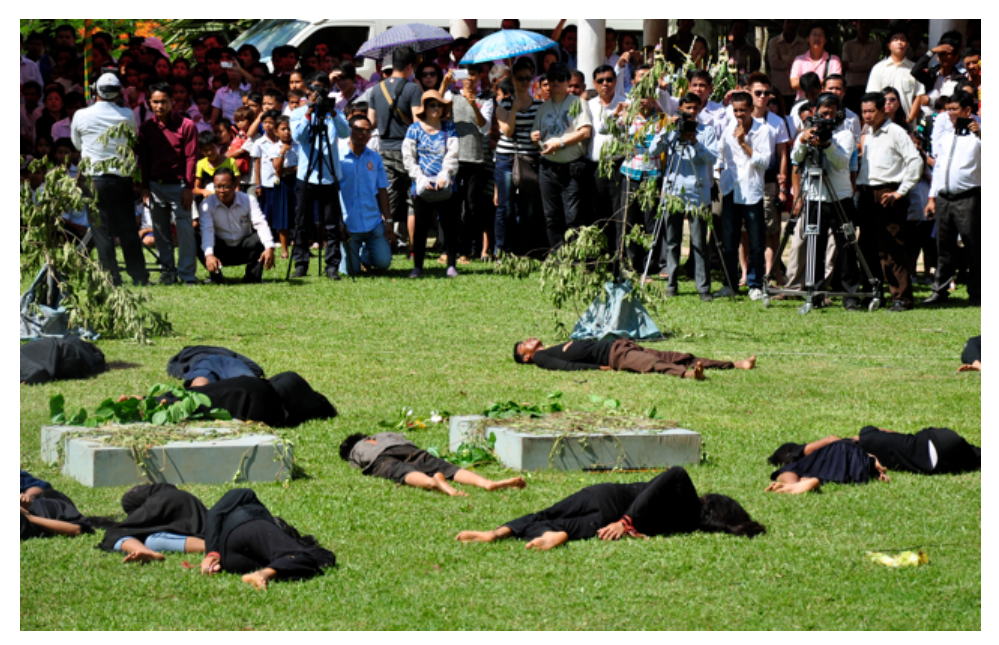
Figure thirteen: Khmer Rouge re-enactment at Choeung Ek remembrance event

To much heralding, soldiers in the military uniforms of the government marched in, holding high three flags: the blue flag of the National Front<sup>212</sup>, the red and yellow flag of the People's Republic of Kampuchea (PRK), and the blue flag of the Cambodian People's Party (CPP), but noticeably missing the Vietnamese flag. If the message had been obtuse before, these final flags made it explicit: the CPP saved Cambodia from the Khmer Rouge. As the re-enactments ended, and after a few short chants to send merit to the dead, the attendant monks stood to collect offerings from the attendees. As they rose, the âchar once again took the microphone: 'Don't forget to vote for the [Cambodian People's] Party in the elections in July.'