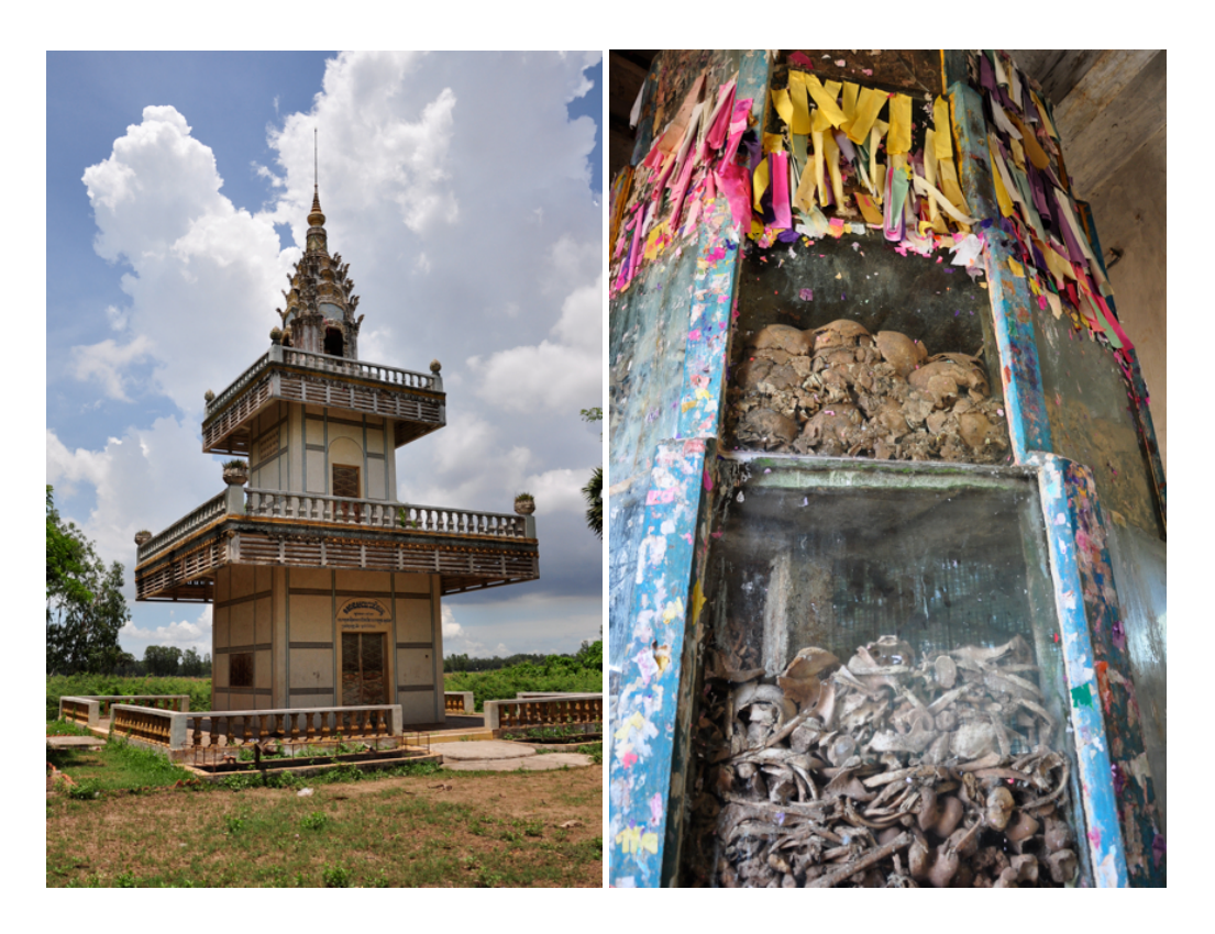
Figure eight: Po Tonle stupa with remnants of Cheng Meng decorations

All of these factors enable those killed under the Khmer Rouge to be embraced within the system whether or not traditional ceremonies and rituals were practiced during the regime. This is only possible because of the flexibility and resilience of Khmer Buddhism and animism, which enabled them to persist despite efforts to destroy them, and to resurface after the regime, with provision made to deal with the ruptures and chaos caused by the regime.