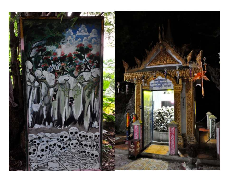
Figure twelve: Khmer Rouge tourism at Phnom Sampeau

It is not only Choeung Ek that uses the past in such a way. The p'teah khmouch at Koh Sop has been preserved and the pastor from the island's church regularly brings foreign visitors to see it. A ghoulish painting close to the entrance of Phnom Sampeau in Battambang indicates its former use; there local guides take tourists on the back of their motorbikes to see where people were thrown from the top of the mountain into a cave below, before guiding them to the spot where their bodies were smashed and the remains now sit, piled high in a concrete cheddei (figure twelve). In Anlong Veng Ta Mok's house, the alleged site of Pol Pot's funeral pyre, and the burial site of his cremains, have all been turned into tourist sites, renamed as 'The Cultural Site of the Khmer Rouge.' Market sellers in Phnom Penh have embraced this interest, producing acrylic TinTin covers featuring the Khmer Rouge, and selling replica propaganda posters from the Vietnamese war.