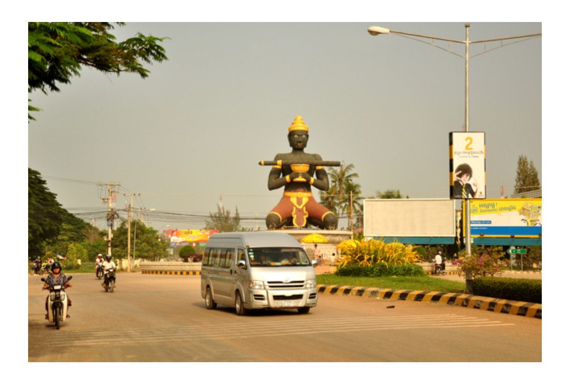
Figure nine: Neak Ta on the main road into Battambang

architectural landmarks of cities and towns (see figure nine), they own and govern the landscape of Cambodia. By engaging in reciprocal relations with the humans inhabiting or using their space, they demand respect for their property and, in return, offer protection and good fortune for those who provide for them. Failure to give respect (by asking permission to use the land and giving offerings) can be harmful - misfortune, illness and even death are used to punish those proving disrespectful<sup>99</sup>.