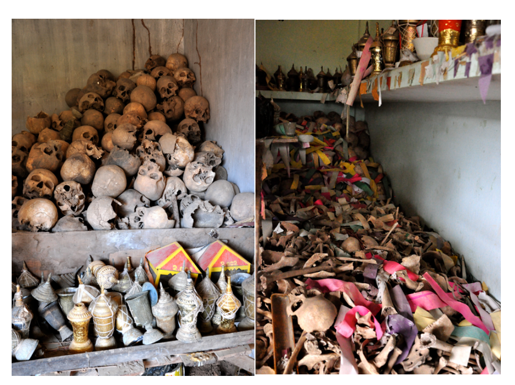
Figure six: Khmer Rouge remains and urns of the poor at two different pagoda

cremation. Cheddei are stupa built specifically to house the cremains of the dead. Mostly built by family members, they are usually constructed within pagoda complexes (because it is the monks who best control the dead (Davis 2009)), however, some people have them built at home. Whilst in an ideal scenario the remains of each individual has their own cheddei , this is only a reality for wealthier Khmer. For many, the cost of the funeral itself is crippling, and the building of a cheddei (which can cost several thousand dollars) beyond their means. Because of this, many pagodas have a communal stupa <sup>83</sup> for the remains of the poor. In several pagodas I visited this communal stupa also houses the remains of those killed under the Khmer Rouge thus caring for all of those whose families cannot (see figure six).