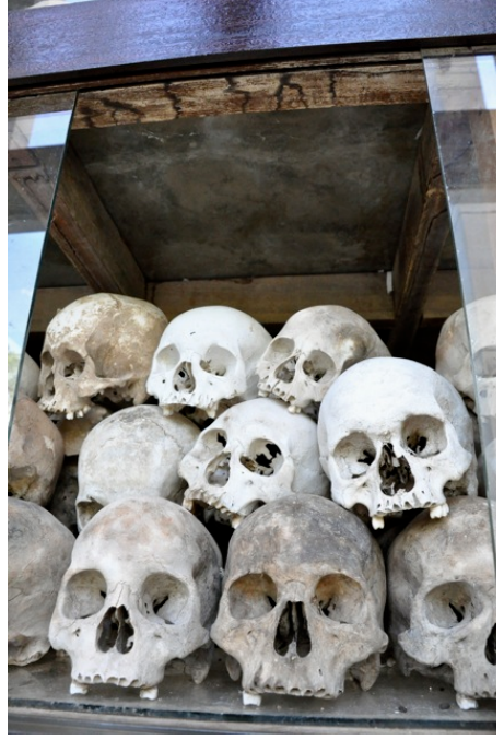
Figure three: Choeung Ek stupa and displayed remains

Bennett (2015): To live amongst the dead