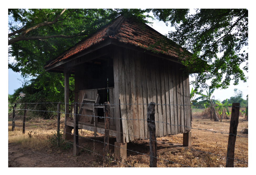
Figure four: Koh Sop p'teah khmouch

Sometime in the late 1990s, or the early 2000s, the remains within Koh Sop's p'teah khmouch were moved from the island to cheddei (stupa) at local pagodas. Though three pagodas took remains the majority went to the wat (pagoda) closest to the district office. They remain there today, locked in a small, unassuming cheddei, only opened at ritual occasions and on the request of visitors.