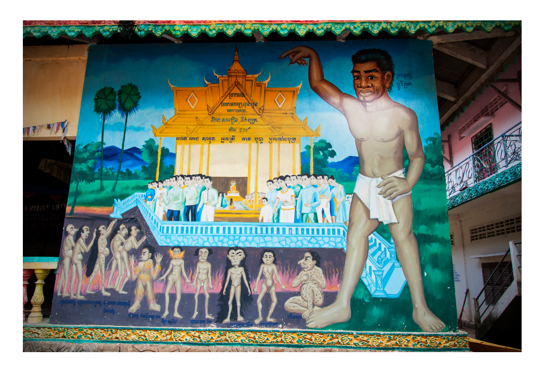
Figure seven: depiction of Pchum Benh at Wat Kampong Tralach

has become so important.<sup>85</sup> Pchum Benh is a collective ritual directed to any whose death was 'undesirable' (i.e. who did not have a peaceful death either physically or morally); as such, it includes allowances for those who died during Democratic Kampuchea.