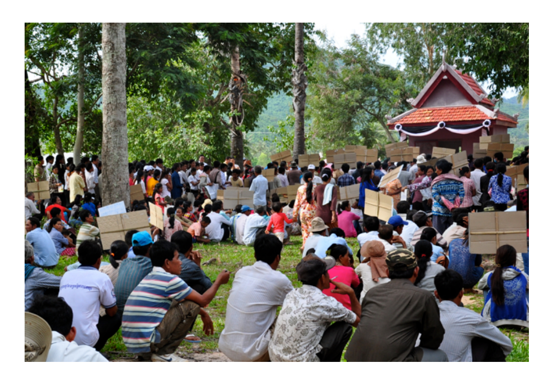
Figure fifteen: Protestors listen to speeches in front of the cheddei of remains

Like the remembrance ceremonies at Choeung Ek, the rally was an event seeking to reanimate the Khmer Rouge, but also evidence of how politics in Cambodia is performed in spheres of distrust, violence, corruption and manipulation.