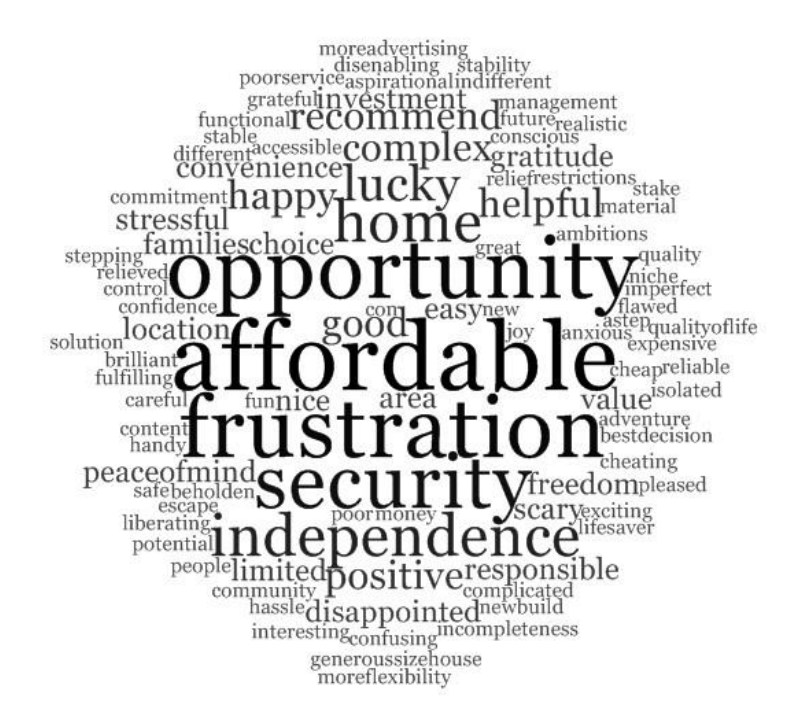
Figure 3: Word cloud characterising research participants' experiences of shared ownership