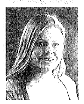
Sally Hunter, Staff Writer,