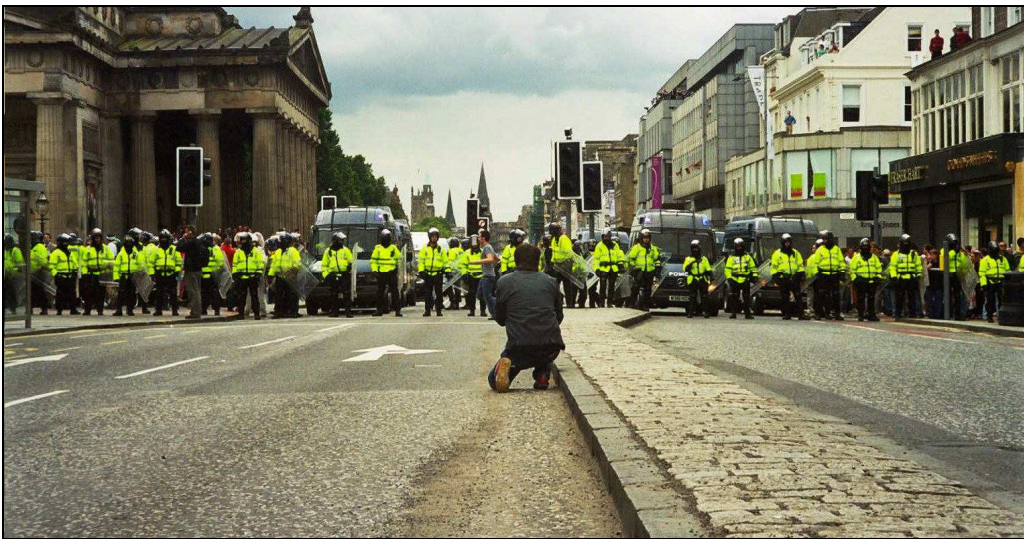
Image 2: G8 Summit 2005 protests, Edinburgh (4 July 2005).

These ideas are further illustrated in the photograph that serves as the front cover of this edition (see Image 2).