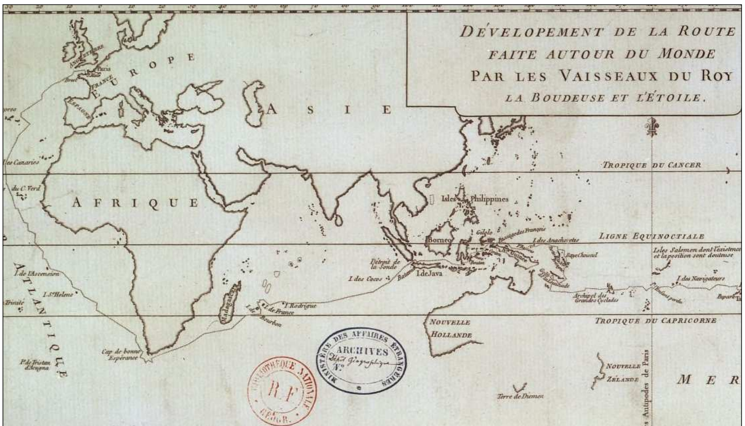
Figure 1. World map by Jean Baptiste Bourguignon d’Anville (1771) from Bougainville’s dairy Bougainville et ses compagnons autour du monde , vol. 1, ed. E. Taillemite (Paris: Imprimerie nationale, 1978).

Bougainville’s map of his company’s travel (figures 1 and 2) clearly illustrates the infinite nature of the world in 1769: Australia has no contours, many of today’s islands are ‘missing’, the earth is an unknown place. The fifth continent did not have a name until the French geographer and cartographer Conrad Malte-Brun named it ‘Oceania’ in his treatise Géographie de toutes les parties du monde , published in 1804.