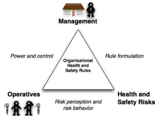
Fig. 4. Compliance triangle

issues are captured by the ‘compliance triangle’ in Figure 4, which highlights three areas: (1) power and control, (2) rule formulation and (3) risk perception and risk behavior. In the following, we will explore these issues in more detail. Furthermore we will argue that the underlying system architecture of a compliance system will have a profound effect on how a system fits in the organizational context and how it will be appropriated.