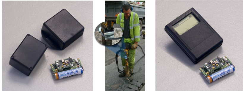
Fig. 3. Sensor-based vibration monitor system with wireless drill & dosimeter (reproduced from [7]).

We have developed a sensor-based vibration monitoring system that falls somewhat between the sensor-network and the artifact model. It consists of a heavy-duty pneumatic drill augmented with a wireless sensor node, and a wireless dosimeter that is worn by operators on top of their protective clothing (Figure 3). The drill measures vibrations using accelerometers, and the dosimeter records how often and how long an operative uses a drill. The dosimeter shows the user's current vibration exposure on a small display. Vibration exposure is estimated in cooperation between drill and dosimeter using information about the drill type and the duration of use. Dosimeters are personal devices: each operator uses his or her own device, yet the drill is shared among workers.