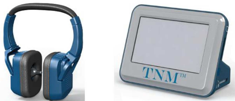
FIGURE 2 | Illustration of the thermo-modulation device comprising two headphone-mounted ear-probes and an AC powered control unit.

Otosopic inspection was performed immediately prior to the first session of stimulation to check for excessive cerumen (which may limit temperature transfer) and to confirm that the external ear canal and tympanic membrane were normal in appearance. With the intention of increasing activity in the damaged left hemisphere, CVS was applied to the right ear canal for 30 consecutive days excluding weekends. CVS sessions lasted 20 min during which time probe temperature cycled continuously between 35 and 17°C, achieving approximately eight complete cycles. This gentle transition between warm and cool made the procedure easy to tolerate, and as expected, participants showed no evidence of disorientation or discomfort during stimulation, nodding when asked if the procedure was comfortable. Throughout stimulation, participants sat upright and were