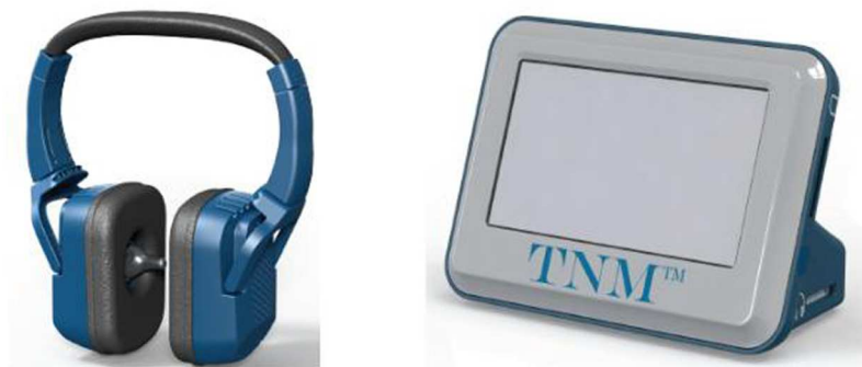
FIGURE 2 | Illustration of the thermo-modulation device comprising two headphone-mounted ear-probes and an AC powered control unit.

Otosopic inspection was performed immediately prior to the first session of stimulation to check for excessive cerumen (which may limit temperature transfer) and to confirm that the external ear canal and tympanic membrane were normal in appearance. With the intention of increasing activity in the damaged left hemisphere, CVS was applied to the right ear canal for 30 consecutive days excluding weekends. CVS sessions lasted 20 min during which time probe temperature cycled continuously between 35 and 17°C, achieving approximately eight complete cycles. This gentle transition between warm and cool made the procedure easy to tolerate, and as expected, participants showed no evidence of disorientation or discomfort during stimulation, nodding when asked if the procedure was comfortable. Throughout stimulation, participants sat upright and were