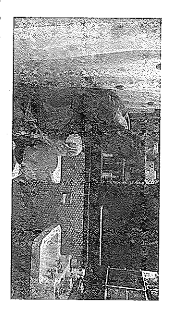
11.2: Reuben's irritable bowel syndrome makes itself conspicuous on a date.

I argue that the homme-com consciously blends this type of gross-out moment with the romance plot of the standard rom-com in order to get something new, male-centred and assumed to appeal to male audiences. It might also be suggested that such films are attempting to appeal to younger audiences too. While the Ephronesque rom-com is