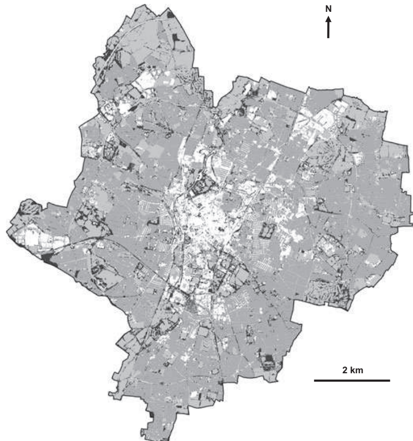
Fig. 2. The distribution of above-ground vegetation carbon across Leicester, according to the landcover–land ownership category of individual vegetation patches (Table 1): graduated shading from 0.00 \text{ kg C m}^{-2} (white) to 28.86 \text{ kg C m}^{-2} (dark grey).

An estimated 231 521 tonnes (95% CI = 195 914–267 130) of carbon is stored within the above-ground vegetation across the city (Table 1; Fig. 2), equating to a mean figure of 3.16 \text{ kg C m}^{-2} of urban area (95% CI = 2.65–3.62). Of this total, 97.3% (225 217 tonnes; 95% CI = 189 613–260 821) consists of carbon stored in trees. A further 1744 tonnes (0.7%) is contained within woody vegetation, with the remaining 2% (4561 tonnes; 95% CI = 3706–5417) attributed to herbaceous vegetation. The mean percentage carbon content of herbaceous vegetation was 42.02% (95% CI = 41.34–42.69), corresponding