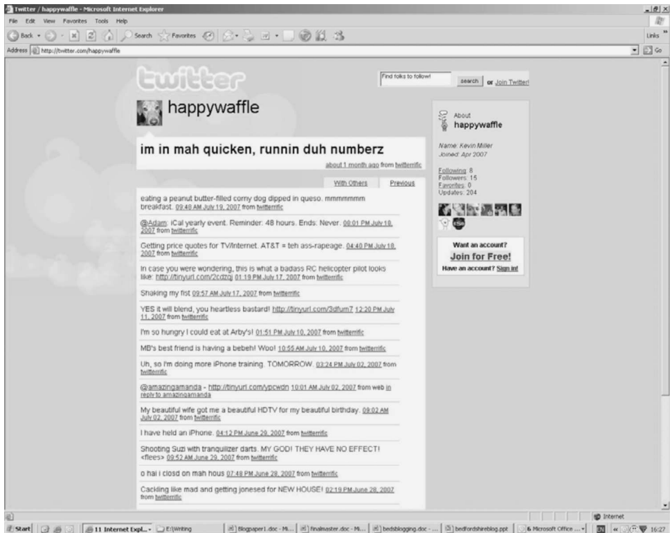
FIGURE 3 Typical Twitter Profile (accessed 5 September 2007)

The point of twitter is the maintenance of connected presence, and to sustain this presence, it is necessarily almost completely devoid of substantive content. Thus twitter is currently the best example of 'connected presence' and the phatic culture that results