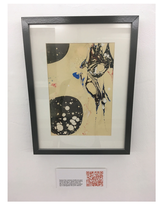
Exhibition image plus QR code to access music.

of the hospital was ubiquitous, seeping through the closed studio door. Commonly we heard footsteps, dialogue, invitation (to join a class, have a snack), resistance, punctuations of our sessions as participants left to receive treatments, and at one point, the sound of a game of badminton being played in the corridor outside our studio. These merged into what Bates (2021) calls a general "swirl" of hospital soundscape. Beyond the building, the drone of traffic on the high street and sirens of passing ambulances were reminders of ongoing acts of care, and an outside world inaccessible to many patients.