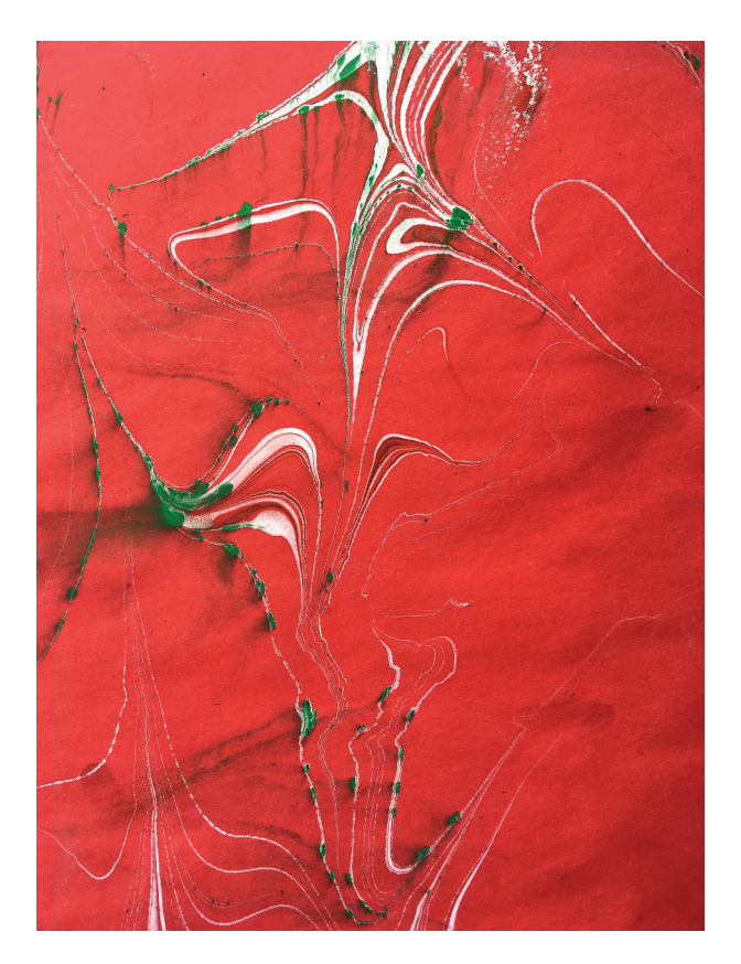
B's marbling print (NKM). Photo Chloe Cooper, with permission.

available but not always employed. Two participants recorded sounds quiet enough to nest inside the ambient environment. When the microphone was moved closer to the sound source, participants played even more quietly, so they could still hear external hospital sounds. Turning up microphone gain (enabling stronger signals on the recording device) amplified environmental as well as instrumental sounds. An audio recording can be heard at: https://doi.org/ 10.6084/m9.figshare.26589166.v1.