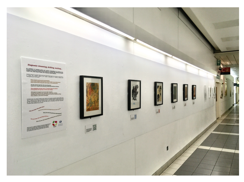
Exhibition -, Chelsea and WEstminster Hospital, 2021.

Hospital (Figure 1). Musical aspects of the work were accessible via QR codes. The public exhibition offered alternative identities to project participants as providers of culture, rather than receivers of care (CW+, 2021).