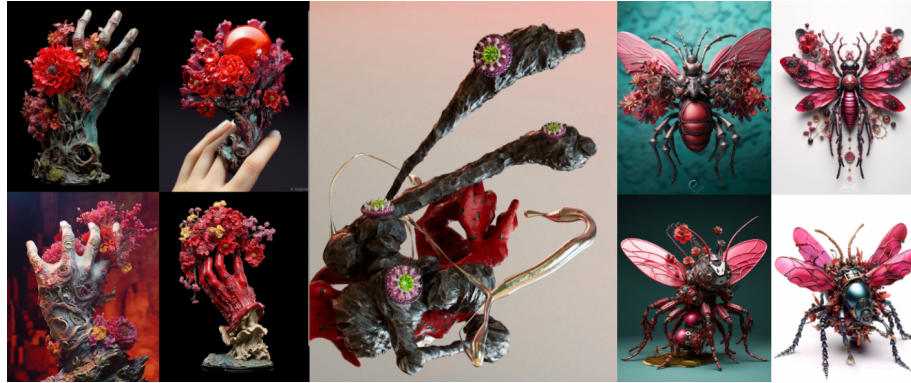
Fig. 1. Two examples of the Img2Text2Img technique. The middle image is the original digital artwork and the grids on the sides are the ones generated by Midjourney. The text interpretations provided by Midjourney where: i) left image grid: “a man with flowers on his finger, in the style of sculptural chaos, hyper-detailed rendering, glass sculptures, light black and crimson, biomorphic forms, mimicking ruined materials”, ii) right image grid: “a sculpture of an insect, in the style of dark pink and emerald, photorealistic detail, floral explosions, dark silver and red, intertwining materials, organic formations”

experimenting with the AI-tool. Finally, participants completed a questionnaire and participated in an interview for in-depth discussion of their experiences.