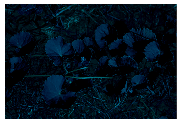
Figure 2 Centella asiatica compound health tea ingredients