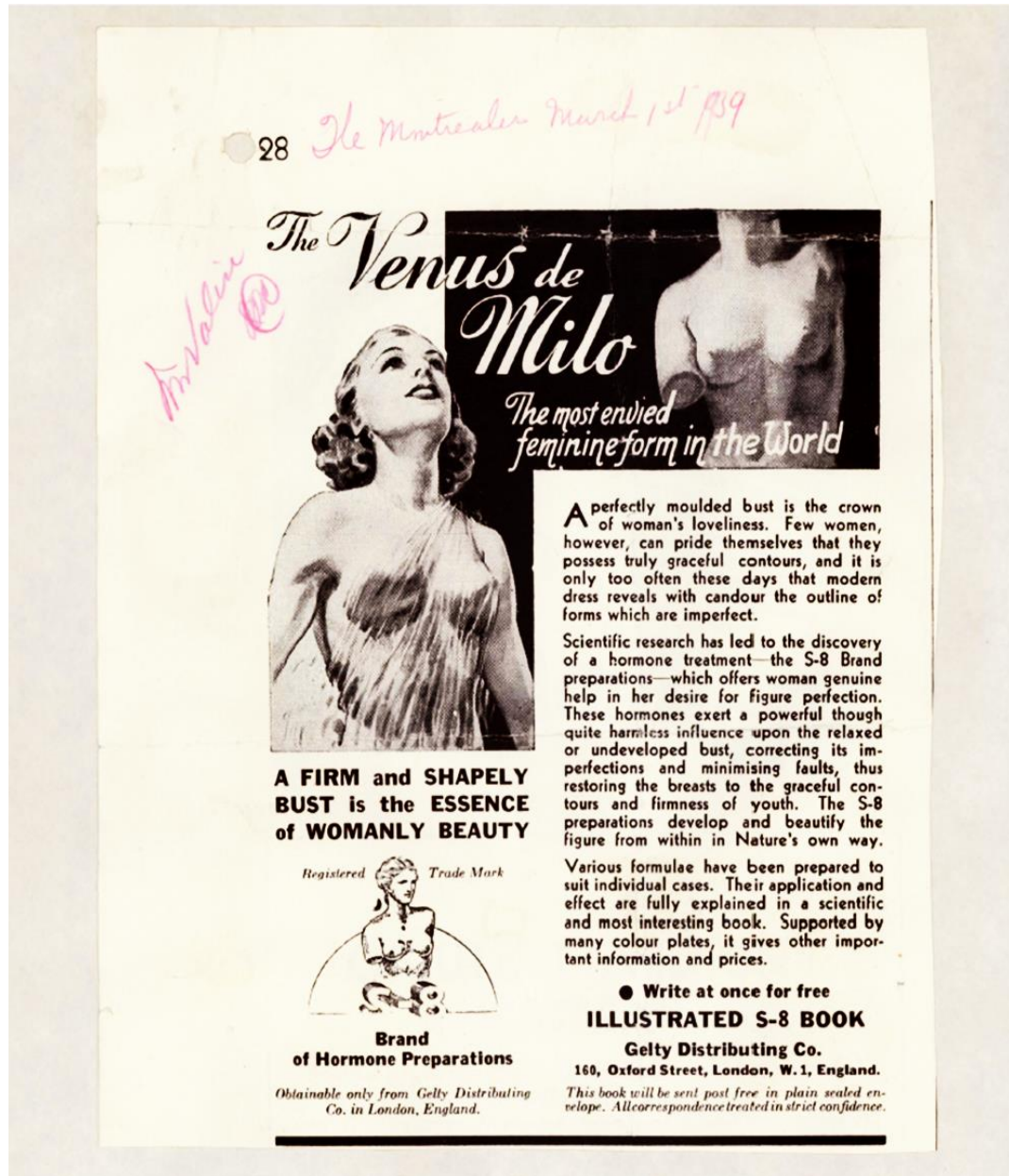
Figure 1. Advertisement for S-8 Brand of Hormone Preparations, 1 March 1939. Library and Archives Canada, RG 29, volume 258, file number 347-1-6 (Part 2), reproduction copy number e-011195705.