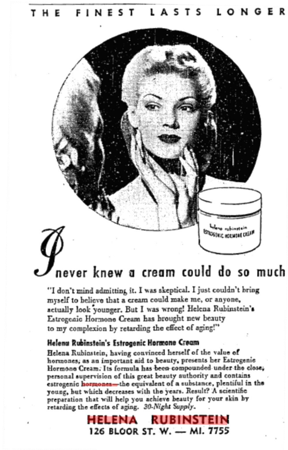
Figure 3. Helena Rubinstein advertisement, Toronto Daily Star , 6 April 1945. "A scientific preparation that will help you achieve beauty for your skin by retarding the effects of aging. 30-Night Supply." Reproduced with permission of the copyright owner. Further reproduction prohibited without permission.