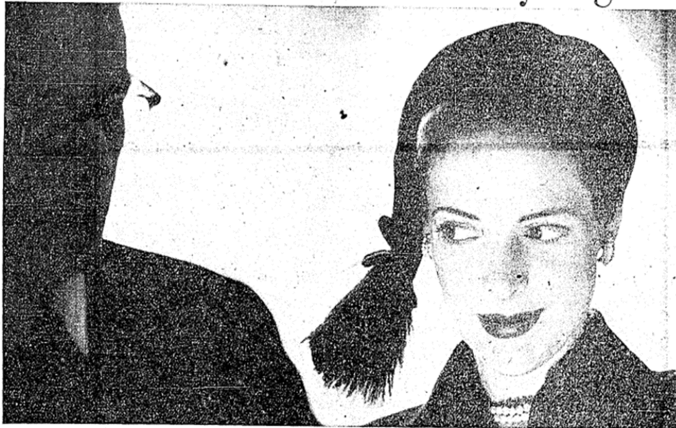
"YOUR HUSBAND LOOKS AT YOU WITH NEW INTEREST!"