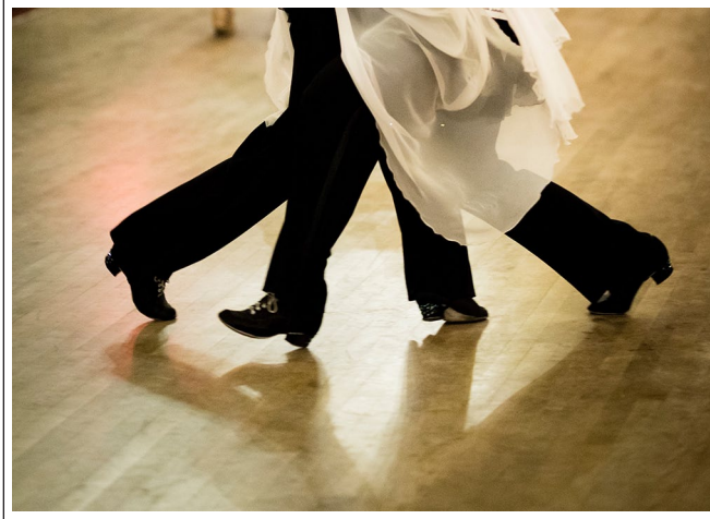
Figure 5. A dance couple in Cuban heels.