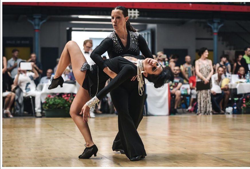
Figure 2. A couple in the women's Latin category of the 10th gay games in Paris; the leader is in flat shoes and the follower is in stiletto heels.