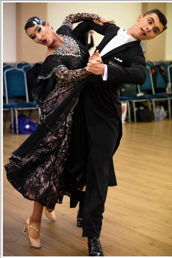
Figure 4. Classical appearance of a modern standard ballroom dancer.