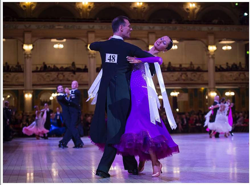
Figure 1. Standard dance couples in the 2016 British National Dance Championships. A traditional male/female couple is in the foreground, and an equality (same-sex) male/male couple is in the background.