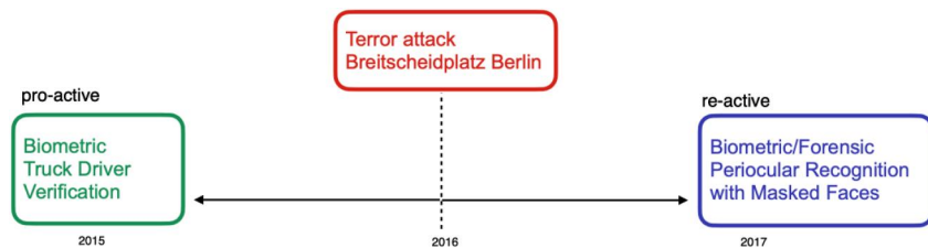
FIGURE 1 Pro-active measure, to prevent an incident and re-active measure in criminal investigations.

The issue of how to abolish the internal borders that some EU Member States have temporarily reintroduced on their territories after several terrorist attacks and the current