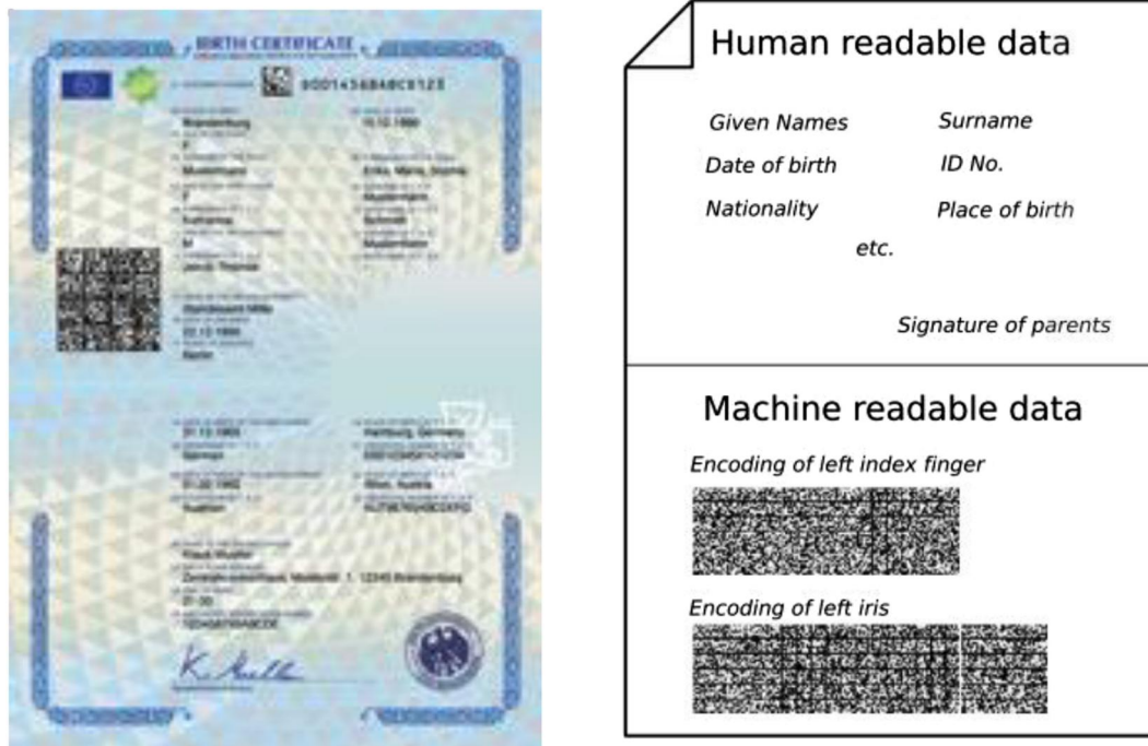
FIGURE 5 Proposed birth certificate from the FIDELITY project [46]. Left: Draft product design. Right: Sizes of barcodes correspond to the approximated storage requirement for the compressed biometric sample.

The European Standardisation body (i.e. CEN/TC 224/WG 19) is working on secure and interoperable Breeder Documents and incorporating biometric references. This work was initiated on request of the European Commission.