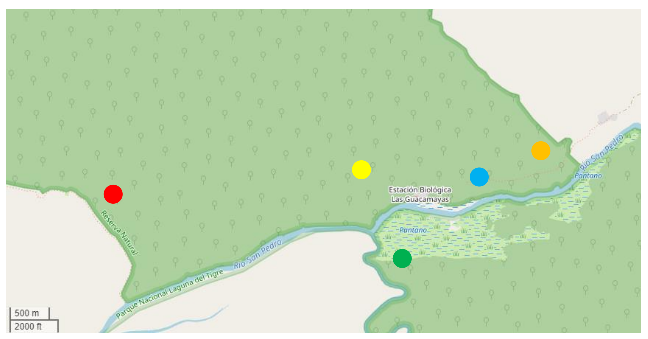
Fig. 2: Map of the southeast region of Parque Nacional Laguna del Tigre showing the location of survey sites indicated by colored dots: Orange = Agricultural Edge; Yellow = High Forest; Red = Low Forest; Blue = Natural Edge; Dark Green = Saw-grass swamp. The two rivers are the San Pedro River flowing east to west, and the Sacluc River flowing south to north. North of the San Pedro dark green areas indicate forest areas, grey indicates the concessional agricultural land of Paso Caballos. South of the San Pedro, green indicates a mixture of saw grass swamp (sabinal) and seasonally flooded thorn scrub.