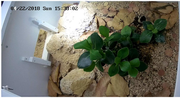
FIGURE 1 View of one-half of a Bermuda skink ( Plestiodon longirostris ) enclosure from a CCTV camera. The enclosures consisted of deep loose clay and gravel-based substrate, coral-based rocks, and sea grape leaf litter ( Coccoloba uvifera ) for cover. Each half also contained a baby rubber plant ( Peperomia obtusifolia ), water and food bowls and basking spot heated by a 70w Exo Terra Sunray basking spot lamp. A sliding gate separated the two halves of the enclosure but was open for the duration of the study period allowing the skink pair access to both sides. [Color figure can be viewed at wileyonlinelibrary.com ]

in the basking zone (from the outer edge to the central zone) with a temperature of 36–40°C, this is a focused basking zone so the drop off outside is steep, but the ambient temperature of the cool zone was between 25–30°C during the day. Ambient room lighting was provided by natural light, which filtered in through skylights and windows and enclosures were maintained at 70% relative humidity. Ambient air temperature and humidity were measured with a wall-mounted digital thermometer and hygrometer, Blue Maestro data loggers were used for long term monitoring of temperatures within the enclosures and a digital infrared temperature gun was used to monitor basking spot temperatures. Enclosures had a photoperiod of 11 h between 07:00 and 18:00 h.