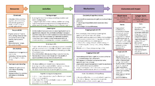
Figure 2. Revised Logic Model Based on Stakeholder Input

'Resources' replace 'Inputs' to reflect the importance of stakeholder investment. Our revised model recognises the need for staff to allocate time for the pathway during already stretched clinic appointments and pressured workloads. Stakeholders felt the capacity of MS nurses was particularly limited and this led us to reconsider which team members are best placed to support a new pathway. Other staff (e.g., psychologists, OTs) can be involved with appropriate training. Kalb et al. (6) acknowledge insufficient resources and highlight the lack of adequately trained clinicians as barriers for addressing cognitive problems. Training was therefore retained within the revised model with cognitive screening, triaging, management, and supervision packages now specified to reflect our new insights and explain how services can equip multi-disciplinary team members to deliver the pathway. Improved awareness of the importance of addressing cognitive problems within healthcare drivers/ recommendations and accepting shared responsibility for cognitive problems as part of comprehensive care provision amongst the wider neurology community will also help engage clinical staff with the pathway.