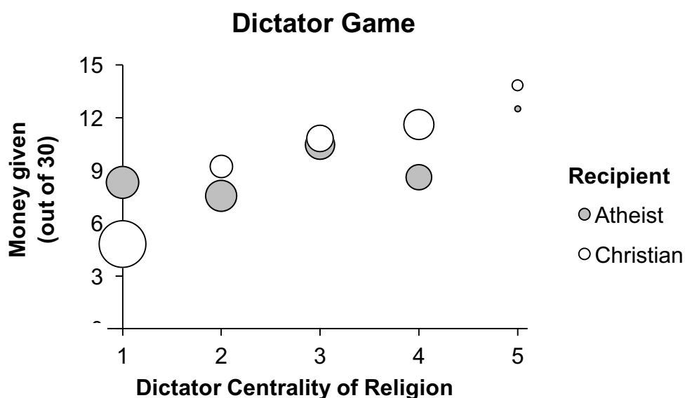
Figure 1b. Transfers in cents in the Dictator Game in Study 1 as a function of recipient and participant religiosity (binned to the nearest integer with the mean displayed across all observations in that bin). The size of the dots is proportional to the number of observations.

We next conducted these analyses using each individual component of the CRS to test whether these effects were explained by one particular component of religiosity. While there were significant main effects of all five components of the CRS when analyzed separately,