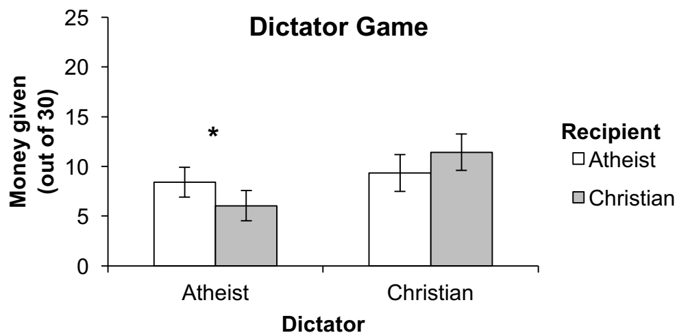
Figure 1a. Self-identifying Christian participants transferred more than atheist participants towards both Christian and atheist recipients in a Dictator Game. Error bars represent 95% C.I.s