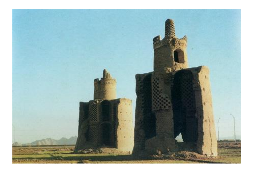
Figure 2. Pigeon tower and granary on the Iranian plateau.

Once again, history provides clues to a possible solution, as before 18<sup>th</sup>C CE trans-global sea trade, phosphate fertiliser was principally organic in nature. In Isfahan, Iran, ancient towers predating Islam were frequently built in identical pairs, acting as granary and giant pigeon lofts respectively (18). A secured tower would be the granary, whilst that with openings would be home to pigeons who whilst roosting would produce faeces that could be collected and used to fertilise crops and process leather.