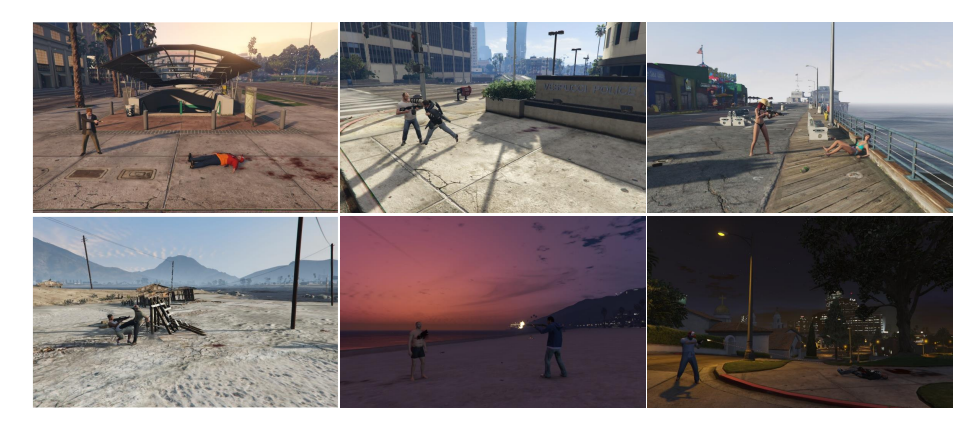
Fig. 1: Frame sequences capturing fights with hot weapons. The captured images exhibit the presence of blood, gun fire and occasionally close quarter combat.

This meant that running a particular scenario multiple times would result in different actions taken by both the aggressor and victim NPC. Moreover, we had no control over the positioning of the NPCs during the fights. Due to this, NPCs' had variations in the position and depth of their fights. However, due to the visible advantages of the weapon, that the aggressor NPC had of extended range and damage, resulted in aggressor winning the fight. These scenarios were set up under different times of the day which include Morning, Midday, Midnight, Dusk, Afternoon and Sunset. The final step required human supervision where the captured sequence was viewed by human observers for anomalies. For each captured video, unwanted frames were removed. Figure 1 shows a sample of frames captured from hot weapon fights. Here we can observe the visible presence of blood and gunfire. While Figure 2 illustrates cold weapons with 'swinging' and 'shoving' actions being performed against the victim.