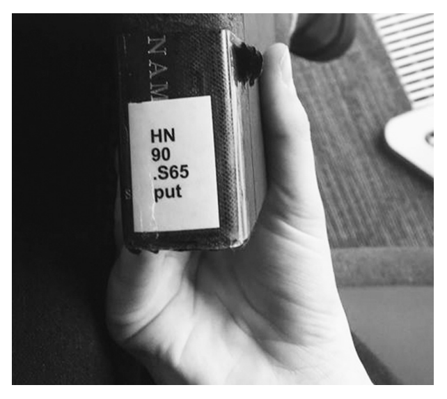
Figure 2 Example of good practice: easy to read spine labels praised by a student with a visual impairment (participant photo).

The students identified many things the University does well, in addition to picking out things that need to be improved. As we report on our research, we will make a point of recognising and praising this good practice, so that colleagues feel encouraged to carry on doing things we already do well, as well as making improvements where we may be falling short (Figure 2).