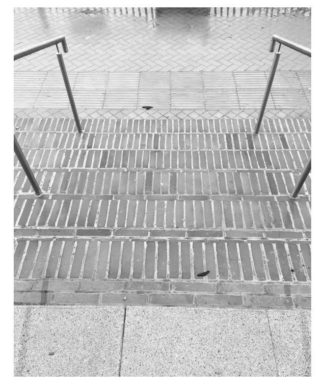
Figure 3 Lack of contrast on the library steps.

to seeking feedback and then meaningfully engaging with it to make improvements.