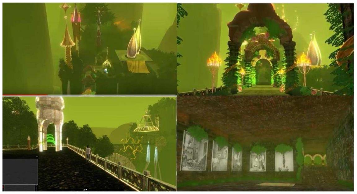
[Insert: Figure 7: ARAF (Blue Mars)]

This perceived freedom to articulate identities also implies the creation of places which sought to provide a transformative experience in the appreciation of artwork, and the embracing of the possibilities of digital space as an open art form – advancing the utopian belief in the untapped potential for spatial expression (and thus the provision of experiences) in digital worlds. For example, ARAF (Figure 7) is a sumptuous world created in Blue Mars by animator and digital artist Sivan Okcuoglu, based on the drawings of Turkish illustrator, Bahadir Baruter. Exploration of this world alone could take hours, filled with amazing vistas and spectacular detail.