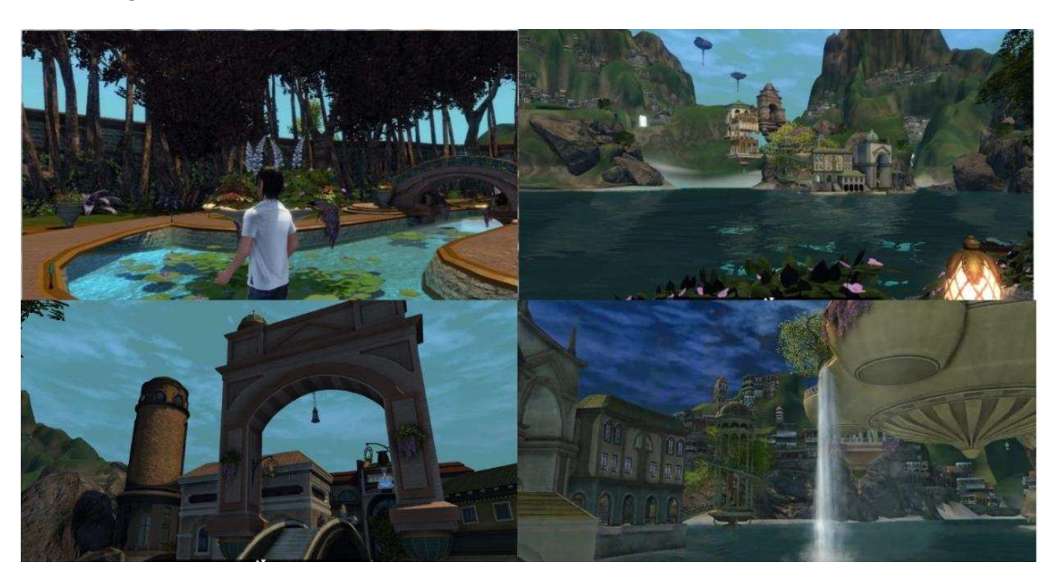
[Insert: Figure 8: New Venice (Blue Mars)]

now lie abandoned despite the herculean effort and creative energy that some of these constructions must have required. One is reminded of the waste, and the hundreds of hours of toil, all of it seemingly for nothing.