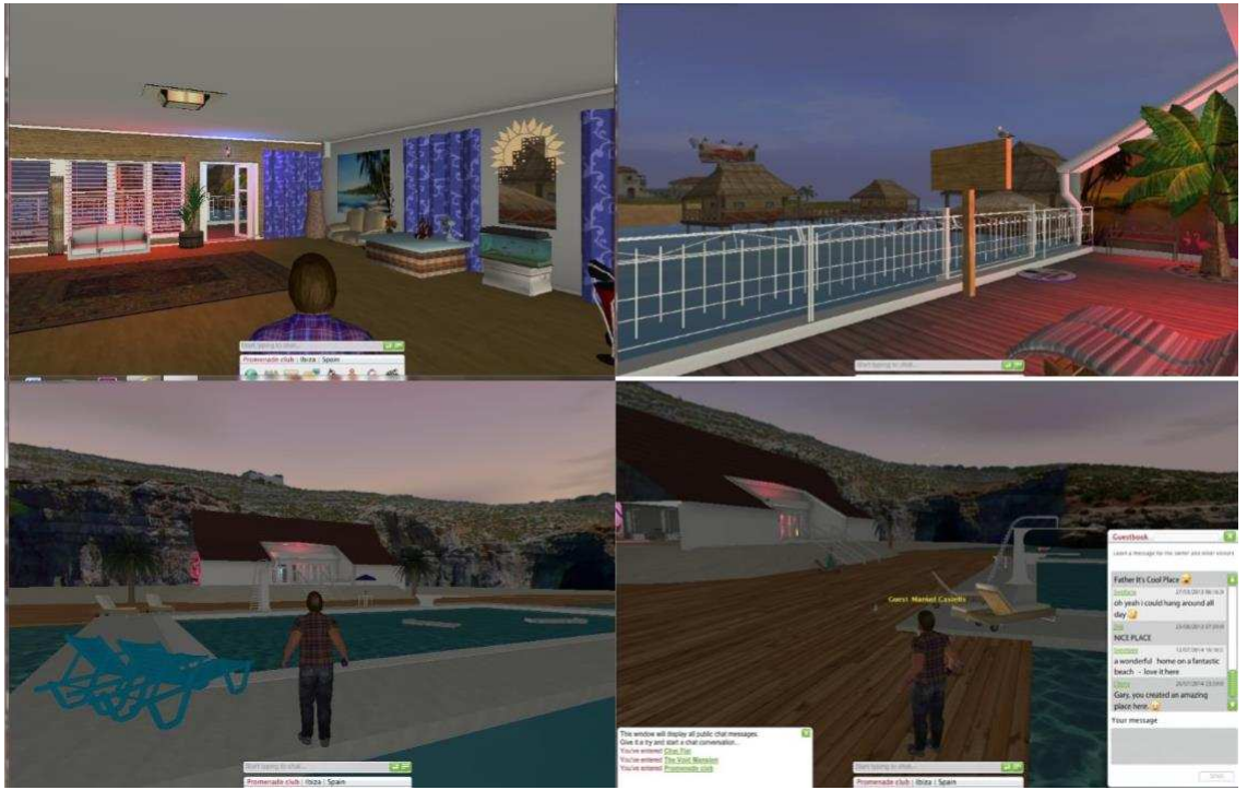
[Insert: Figure 4: Promenade Club (Twinity)]

Likewise, 'Chameleon's Den' (Figure 6), a sumptuous Italian Villa in Active Worlds , demonstrates these ambitions in a more grandiose fashion. Its grand hall, guest house, fountains and swan-shaped boat perhaps speak to Nouveau-riche sensibilities. There is, due to its current emptiness, now a sense of peace conveyed by one's ability to navigate it unhindered, though this peacefulness is interrupted by the presence of a series of photos of family and friends, and thereby a feeling of trespassing. These photos add a touching intimacy to the expansive rooms and haunts the space with the reminder that behind these absent avatars are people who invested not only time, but emotion, into these places. The fact that these photos too were abandoned leaves us to speculate on the meaning and circumstances of their abandonment. This constant decoding of intent is how we experienced abandonment in such contexts, and, as visitors, we simultaneously recognise the implied utopic narratives within these creations as well as feeling powerless to overturn their fate.