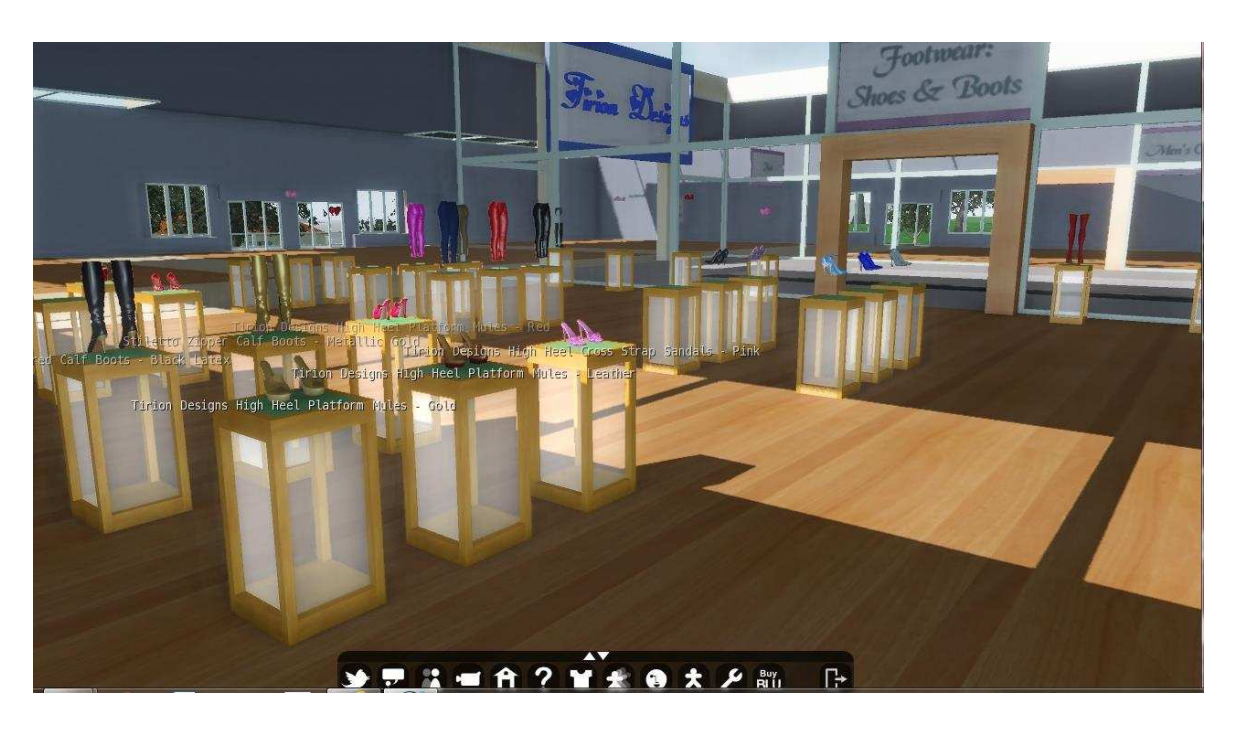
[Insert: Figure 1: Firion Designs (Blue Mars)]

The simulation of a real-life shop window also simulates its failure. In the real world, those shelves would be empty. Someone would have wanted them. Present here is an uncanny recognition of the fragility of real world structures with equivalent functionality. Thus, digital ruination, is also an experiential concept; the experience of ruin is a feeling mediated by the recognition of real life loss of value. Nobody wants these things.