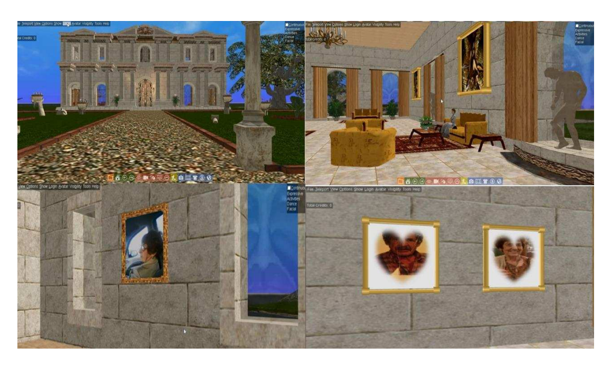
[Insert: Figure 5: Chameleons Den (Active Worlds)]