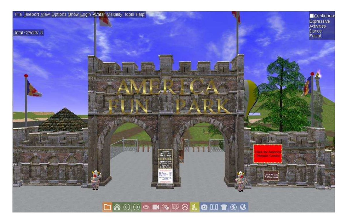
[Insert: Figure 2: America fun park (Active Worlds)]