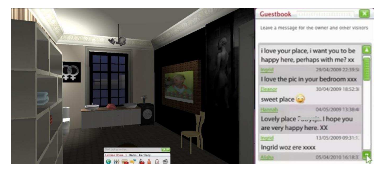
[Insert Figure 6: Lesbian Home (Twinity)]

This perceived freedom to articulate identities also implies the creation of places which sought to provide a transformative experience in the appreciation of artwork, and the embracing of the possibilities of digital space as an open art form – advancing the utopian belief in the untapped potential for spatial expression (and thus the provision of experiences) in digital worlds. For example, ARAF (Figure 7) is a sumptuous world created in Blue Mars by animator and digital artist Sivan Okcuoglu, based on the drawings of Turkish illustrator, Bahadir Baruter. Exploration of this world alone could take hours, filled with amazing vistas and spectacular detail.