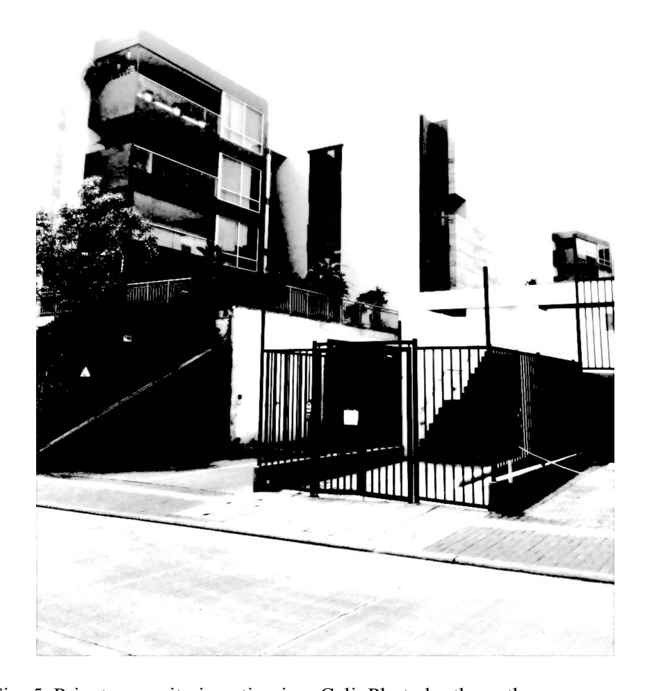
Fig. 5. Private security in action in a Cali.