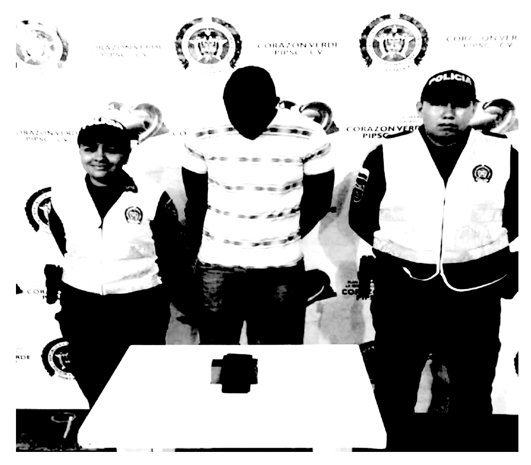
Fig. 1. Mobile thief captured by local police in Cali (HSBNoticias.com, 24 Sep. 2015).

In this context, Cali has become a privileged place in which to test the new range of discourses and developmental practices associated with security, which we began to describe in the introduction. Known by the general label of Security and Development, these new practices and discourses are part of a recent 'know-how' and a new chapter of global governance which aims to achieve public security, or what is also known as 'citizenship security', in cities like Cali. Interestingly in Cali, as we will see, the decision of the city's administrative organs to embrace the Security and Development agenda has not been accompanied by the expansion of the typical 'firm hand' associated