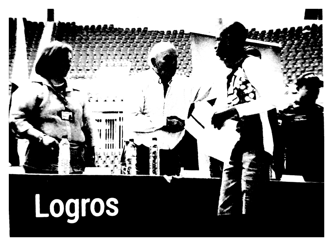
Fig. 2. Cali's mayor, Maurice Armitage, congratulating a young man who benefited from the Youth without Borders programme ( Jóvenes sin Fronteras ), one of the schemes created by the local administration to 'integrate' young people involved in gangs into the city's formal life. Photo included in the official brochure of the programme (2016).

The new Security and Development practices just described rely on what we call 'neo-developmental punitive technologies'. These technologies often combine conditional services with psychosocial attention offered to vulnerable young people as a tool of crime dissuasion and social inclusion. As we show in the next sections, these 'conditional services' materialize in the form of employment, sport, education and more general care services delivered by public and private institutions and community police officers in partnership with local actors and the local administration, on condition of behavioural change on the part of their young recipients. These conditional services represent a brave attempt to return to pre-neoliberal times in which welfare, in particular full employment, or the aspiration to generate it, constituted the organisational force behind state action and the construction of citizenship (Esping-Andersen 1999). However, these benefits and employment options are now not only 'conditional' but also very limited. This is due to the national and local government's financial