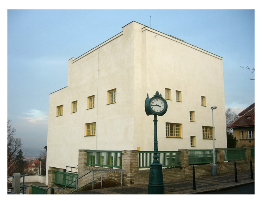
Façade of the Müller House, Prague.

Viennese architects, however, did not aim at breaking with the traditional concept of domesticity altogether. Ideas such as privacy were important for Loos, who designed houses that resembled opaque blocks, such as the Müller House (1930). By erasing all decoration and using concrete as the construction's main material, the Müller House's façade does differ from nineteenth-century constructions, although privacy is still conveyed. Nevertheless, this idea of privacy is not free from a new interpretation when it is considered together with the interior of the house. The interior structure of the Müller House is what creates a new domesticity, in this case, imbued with a sense of the erotic. The Müller house, like many of Loos' designs, is territory for a game of gazes. Inside the massive cube, which this house is, the dweller engages in a visual game formed by different levels and apertures that veil and unveil the different parts of domestic space.