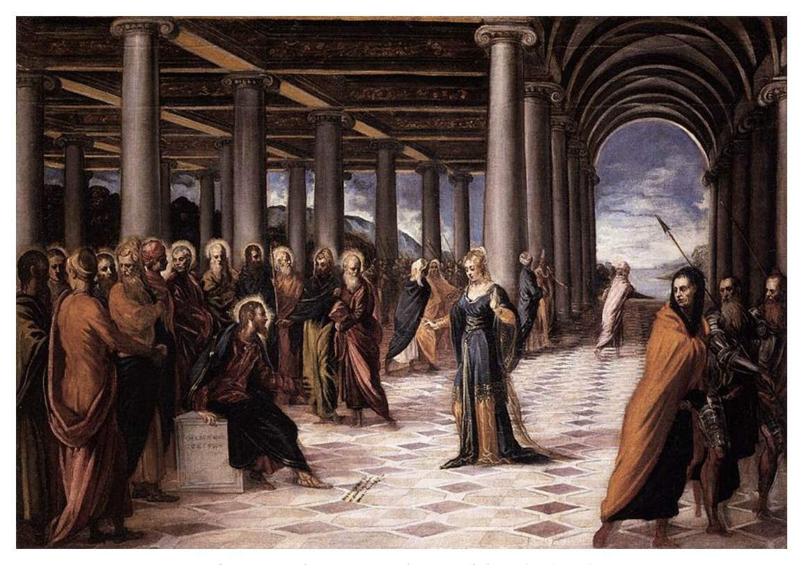
Tintoretto, The Woman Taken in Adultery (1546-48)