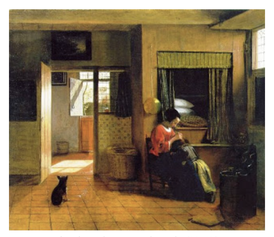
Pieter de Hooch, Interior With a Mother (1658-60)

more accessible reality. Moreover, this accessibility exposes the domestic ideal. The bedroom scene is the 'envers' of representations found in seventeenth-century Dutch painting, which usually depict the semi public spaces of the house: