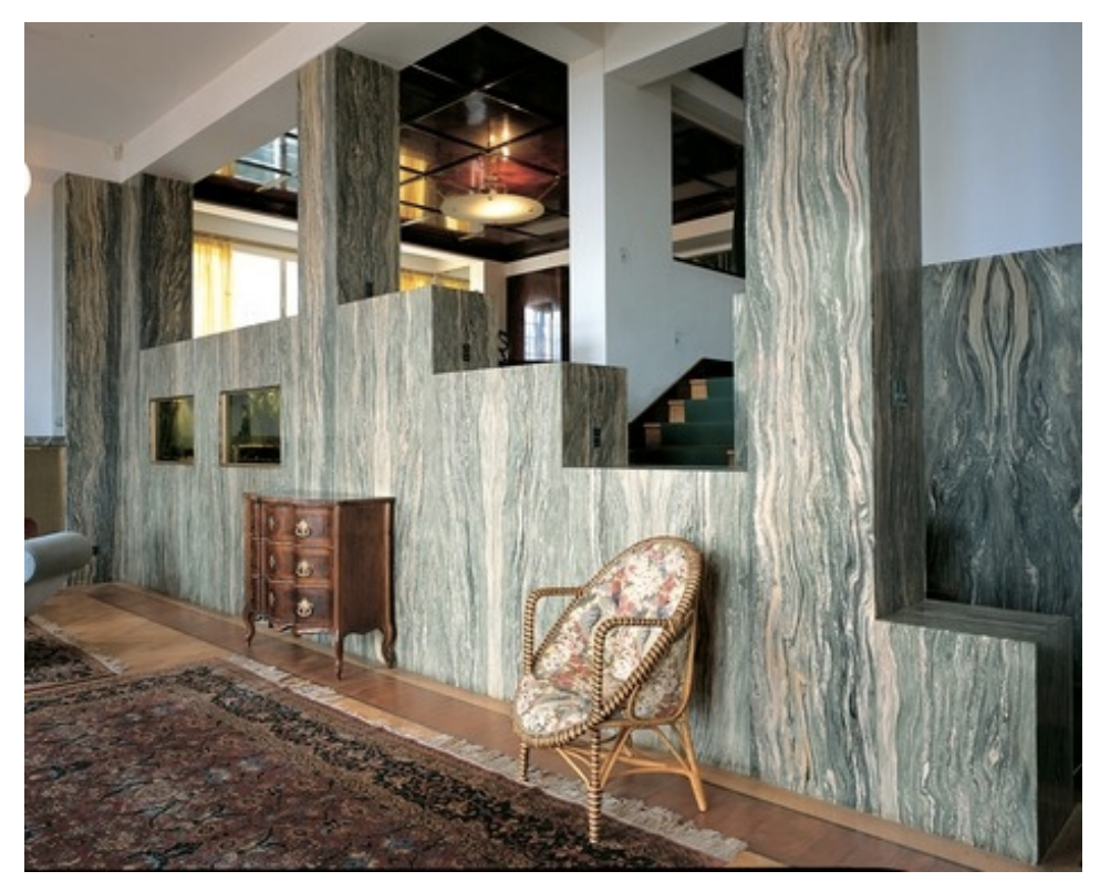
Interior of the Müller House

The above picture shows how the wall separating the salon from the stairs behind presents several levels that lead the gaze through the house in a sensual way by progressively covering or uncovering – depending on the direction – what is on the other side of the wall. This dynamism contrasts with the façade that appears as an immobile massive block with small and gated windows. Thus, the sense of privacy and protection the façade constructs acquires its entire dimension when juxtaposed to the interior: privacy serves the sense of mystery, eroticism, and freedom that takes place inside. Privacy in the Müller house does not protect the domestic ideal but rather transgresses it by creating a playful erotic space. The Müller house illustrates how traditional features of domesticity were not rejected but used to convey a new sense of interior.