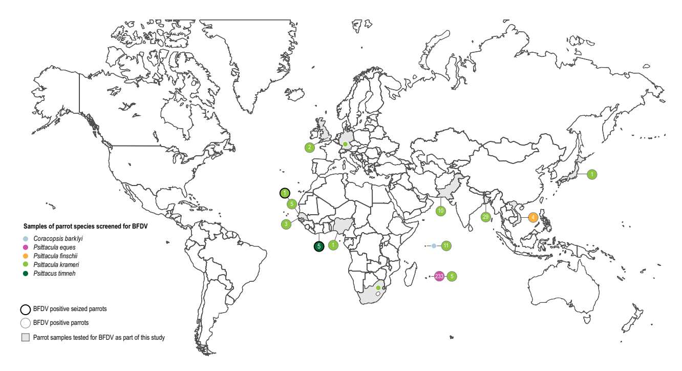
Figure 1. Sampling locations of parrot species screened for Beak and feather disease virus (BFDV) and the number of BFDV positive individuals in each study location.

contamination between samples from different regions. For blood, approximately 50-100 \mu L of whole blood was used from each sample and digested in 250 \mu L of DIGSOL lysis buffer with 10 \mu L of 10 mg/mL proteinase K. For skin and muscle tissue, approximately 4 mm<sup>2</sup> of tissue was used from each sample and digested in 250 \mu L of DIGSOL lysis buffer with 20 \mu L of 10 mg/mL proteinase K. For feather extractions, feather barbs were removed and the calamus was chopped finely prior to digestion in 250 \mu L of DIGSOL lysis buffer with 40 \mu L of 10 mg/mL proteinase K and 70 \mu L of 1M dithiothreitol. Extractions were quantified using a Qubit dsDNA Assay Kit (Thermo Fisher Scientific, Waltham, MA) and standardized to approximately 25 ng/µL prior to BFDV screening where possible because of high yields. The only exception to this protocol was one of the U.K. Rose-ringed Parakeet samples, from which DNA was extracted prior to its being sent to DICE for analysis.