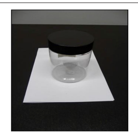
FIGURE 1 | (A) CL-CURVED-OBJECT ON CL-FLAT-OBJECT. (B) Jar on sheet of paper.

The handshapes that she is using to represent different classes of objects are termed "entity classifiers" (which Zwitserlood, 2012, terms "whole entity classifiers," and which comprise both what Supalla, 1986, terms "static size and shape specifiers" and "semantic classifiers"; see Schembri, 2003, for a detailed classification of classifiers in sign languages). Importantly, different sign languages do not necessarily choose the same handshapes to represent the same classes of objects; entity classifiers differ cross-linguistically (Frishberg, 1975; Engberg-Pederson, 2010) and the set of handshapes used in classifier constructions is a subset of the handshape inventory for the language as a whole. A speaker would represent relationships such as those in Figure 1B very differently, using, depending on their language, lexemes such as prepositions, postpositions, circumpositions, locative case markers, or even positional and posture verbs (see Perniss et al., 2015, for a fuller discussion).